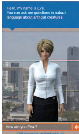
Fig. 3. The graphical interface showing the self-animated 3D character.

The prototype included also three agents for implementing the graphical interface. They controlled the following tasks: (1) get the user entries and diffuse them to the local nano-agents, (2) display the resulting answer in the appropriate window area ; (3) receive the character animation commands and apply them. In the experiments, the character animation is based on a reduced set of pre-computed 3D clips, each one corresponding to a given situation: "hello", "bye", "waiting", "speaking", "surprised" and one for each main mood (cf. section 4.3).