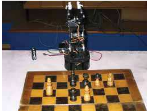
Fig. 4. Chess playing using the robot arm Lynx 5

(Figure 4), video motion detection, sound forced movement, robot dancing etc. We also introduce our students to the robotics applications in medicine, especially to the Brain-Robot Interface paradigm in which recognition of an anticipatory brain potential is acknowledged and reacted to by a robot arm movement.