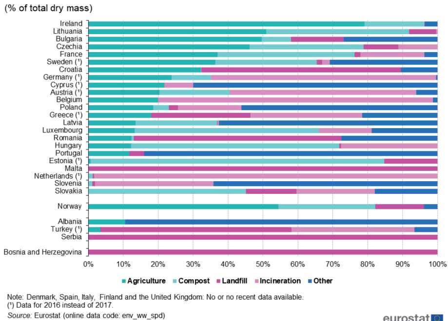
Figure 2. Sewage sludge disposal from urban wastewater treatment, by treatment method. Source: [54].

Directive (Directive 2000/60/EC) has a uniform water and aquatic environment policy, which was enforced on December 22, 2000. It is a unique goal in this global respect to bring all surface water and groundwater into good condition throughout the European Union. One of the points of this effort is to improve water quality by reducing pollutant emissions, which also includes emission limits for nitrogen (170 kg N active substance/ha). The importance of this EU-related legislation in our case study is to determine the minimum required size of forest or SRC.