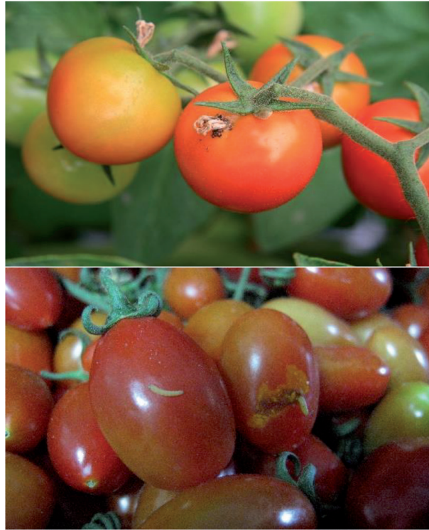
Figure 5. Tunnels in ripe tomato fruits excavated by the larvae of Tuta absoluta.