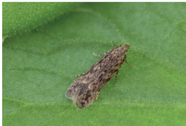
Figure 1. Adult moth of tomato leafminer, Tuta absoluta.

Tuta absoluta was originally described as Phthorimaea absoluta (Meyrick, 1917) in Peruvian Andes. The genus was changed to Gnorimoschema [11] and then to Scrobipalpa [12] and Scrobipalpuloides [13]. Povolny [14] corrected the currently