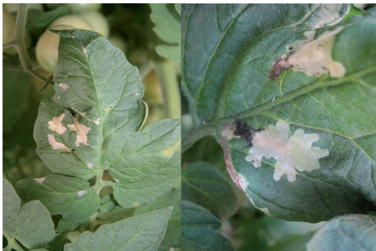
Figure 4. Symptoms of damage appear as mines and galleries on tomato leaves caused by feeding of T. absoluta larvae.