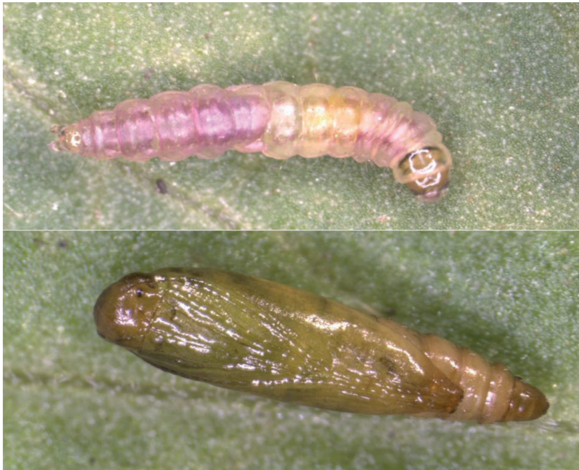
Figure 2. Larva (top) and pupa (bottom) of Tuta absoluta.

used name Tuta absoluta . The EPP code and phytosanitary categorization for T. absoluta are GNORAB and EPP A1 action list no. 321, respectively [8].