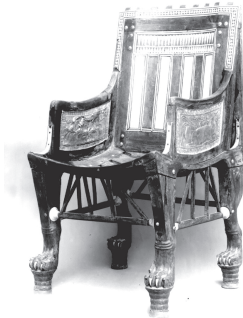
Figure 1. Solid Ebony Chair of Tutankhamun. Physical characteristics: The chair has the following measurements (in SI units): height, 0.715 m; width, 0.406 m; depth, 0.391 m [13]. International system of units.

This chair is one of six chairs found inside KV62.