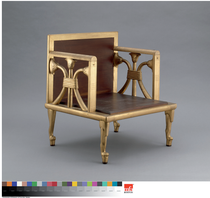
Figure 2. The Chair of Queen Hetepheres (reproduction). Physical characteristics: The chair has the following measurements (in SI units): height, 0.795 m; width, 0.707 m; depth, 0.660 m [9]. International system of units.