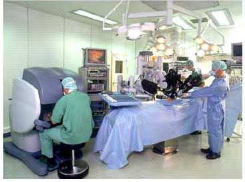
In the da Vinci system, the surgeon sits at a viewfinder (left) and remotely manipulates probes and instruments on actuator arms over the operating table

In 1995 Intuitive Surgical, another company in the field of robotic surgery was formed based on foundational robotic surgery technology developed at Stanford Research Institute. In a short time the company collaborated with leading institutions and companies like IBM, Massachusetts Institute of Technology (MIT), Heartport Inc., Olympus Optical, Ethicon Endo-Surgery and came up with the da Vinci System. In 1997 da Vinci Surgical system got FDA approval for assisting surgery and in July 2000 the da Vinci Surgical system became the first laparoscopic surgical robotic system that got cleared by the FDA to perform surgery. (Figure-2). Then market forces dictated further innovations. The Computer Motion and Intuitive Surgical companies finally merged into a single company, Intuitive Surgical in 2003.