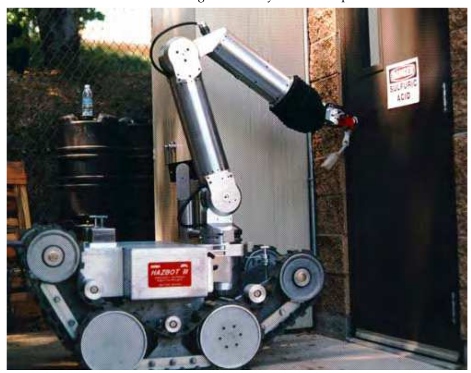
Figure 1. HAZBOT

surgeons could operate remotely on casualties without ever having to enter the combat zone (Cubano et al, 1999) .The engineers from NASA and the JPL also intended this concept for telesurgery in space to enable surgeons on earth to operate on astronauts at the space station. The time lag, however, prevented this from becoming feasible. The development of telerobotic technology was subsequently accelerated by various concomitant advancements in computer and surgical related technology. However, for a long time, placing dexterity enhancing robotic systems in the operating room remained an elusive goal. The further evolution of the robotic surgical system culminated in the development of a different skill and advanced instrumentation resulting in feasibility of the concept.