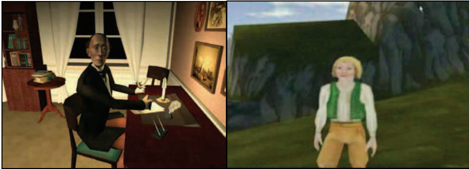
Fig. 1. (left) HCA full-body conversational character in his study; (right) Cloddy Hans is one of HCA's fairy tale characters that can be encountered in the fairy world.

a 3D graphical world via spoken dialogue as well as pen gestures. Several other characters can be added to the system. However, since we did not create a large enough knowledge base large enough for all characters, they would currently interact the same way as the HCA virtual character does. Typical input gestures are ink markers like lines, points, circles, etc. entered at will via a mouse-compatible input device or using a touch-sensitive screen.