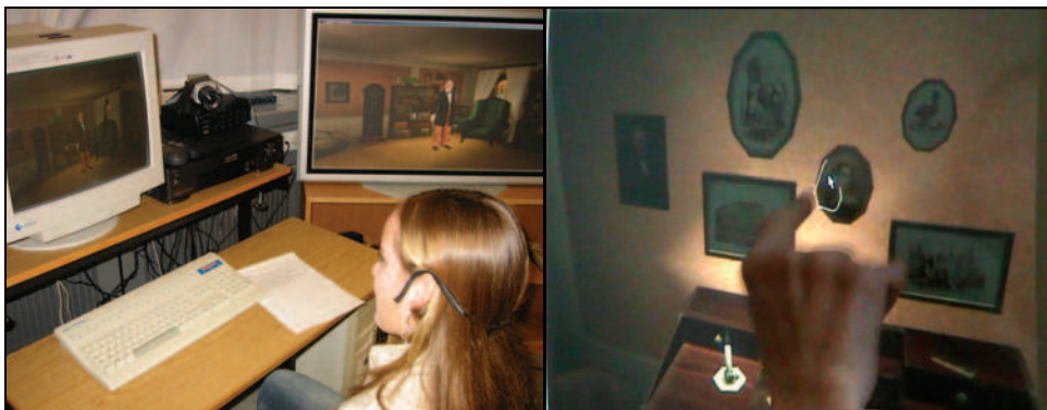
Fig. 4. (left) A child interacting with the system; (right) hand gesturing on a touch sensitive screen to operate a virtual object within HCA's study.

All pupils were Danish native speakers with advanced skills in speaking English. Fifty-three percent of them (100 percent of males and 43 percent of females) declared themselves as being a frequent (i.e. more than 1 hour/week) videogame and/or console player, with a peak of 45 hours/week spent in gaming by a male teenager. 38.5 percent of the participants (28.6 percent of females and 50 percent of males) had been exposed before to computing systems able to process speech and/or gesture; all of them were acquainted with an earlier version of our system. When asked about their favorite games, children said that they like to play with games of any genre, ranging from shoot-'em-up (66.6 percent of males and 0 percent of females), action, platform, to sports and strategy games (40 percent of males and 50 percent of females). With regard to pre-interaction knowledge about the writer, his life, his fairy tales and the historical period he lived in, 53.8 percent of the children (42.8 percent of females and 66.7 percent of males) declared to have a fair to very good knowledge of these historical and literacy facts and events. Despite surprising at first, this high level of knowledge is due to the fact that Odense is Hans Christian Andersen's hometown. In local schools he is often subject of discussion and several cultural events organized by the Odense municipality are often related to its world-renowned citizen.