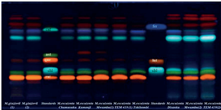
Figure 3. TLC chromatogram of methanolic extracts from M.esculenta (varieties: Chamusuka , Disanka , Kamonji , Mwambu , Tshibombi , TEM 419 ), M. glaziovii with astragalin (ast), caffeic acid (caf), chlorogenic acid (chl), ferulic acid (fer), luteolin(lut), quercitrin(que) and rutin (rut) as standards; developed with ethyl acetate/formic acid/methanol/water (20:0.5:2.5:2; v/v/v/v) and visualized at 365 nm with natural products-PEG reagent. Flavonoids are detected as yellow-orange fluorescent spots and phenolic acids as blue fluorescent spots.

Leaves of Manihot esculenta and Manihot glaziovii contained amentoflavone, quercetin, quercetin-3-rutinoside, quercetin-3-glucoside, and kaempferol 3-rutinoside as flavonoids and caffeic acid, ferulic acid, gallic acid as phenolic acids. Cassava roots, cossettes and cassava flours contained phenolic acids, such as ferulic acid, as major compounds [8]. Hibiscus acetosella contained 2-O-trans-caffeoyl-hydroxycitric acid as major phenolic compounds and flavonoids such as quercetin-3-galactoside. Hibiscus cannabinus and Hibiscus sabdariffa contained neochlorogenic acid as major phenolic compounds and flavonoids such as quercetin-3-rutinoside, quercetin-3-glucoside and kaempferol 3-rutinoside ( Figure 4 ) [16].