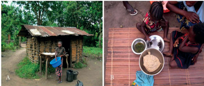
Figure 2. Cassava processing and diet for children of Kahemba. Sun drying of cassava roots soaked in a container by a konzo household of Kahemba city (A) and the structure of a meal for households characterized by a high quantity of fufu accompanied by few vegetables and insects (B).

Few households consumed tea, coffee or herbal teas. Other households consumed boiled sweet cassava roots accompanied by peanuts, voandzous ( Vigna subterranea ) and avocado fruits. Konzo households mostly had one meal per day, consumed preferably in the evenings.