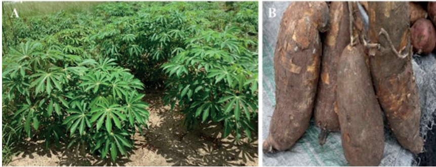
Figure 1. Leaves and roots of cassava ( Manihot esculenta ).

and some minerals and vitamins (vitamin C). The roots are a poor source of lipids and proteins. Manihot leaves contained anthocyanins, flavonoids and other polyphenols. All parts of the plant contained the cyanogenic glycosides (linamarin and lotaustralin) that constitute the antinutrient factors [7, 8].