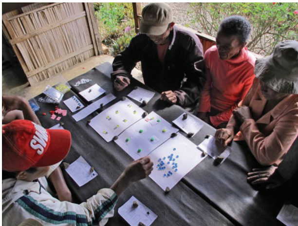
Figure 5. Wetland discussion game: prototype representing lake, marsh, and agricultural zone.

First results suggest that people tend to intensively (over)exploit the system if they have the opportunity to do so. The players quickly establish new effective game rules, which show high similarity to already existing conservation rules. The strength of the game is that the participants can discuss prerequisites, advantages, and disadvantages of different potential rules and then decide themselves which one to try out. During the testing workshop debriefings, participants emphasized the interdisciplinary nature of the game, its suitability for rural resource