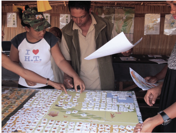
Figure 4. Wetland research game: players track how their individual decisions accumulate on the common landscape.

for freeing emotions and understanding what happened during the game, in order to then bridge the virtual game reality with the real world. Important to note here is that game behavior does not necessarily reflect reality; the game behavior serves as entry point to compare game activities and real life. It also frees people of the social constraints that are often accompanying people during an interview or open discussions on topics of potential conflict. A follow-up monitoring 1 week after the workshop allows researchers and players to exchange one by one on further details and thoughts concerning the issue at stake. Participants acknowledged the opportunity to openly discuss land-use strategies and decisions and appreciated the fact that they could also exchange controversial ideas in the workshop setting without entering in disputes. Several gamers perceived that the game offered them a new, broader perspective on their surroundings and the ongoing processes in reality. They further described in the debriefing sessions that game behavior matched real-life behavior from about 50 to 100% and thought that the gaming experience would help them to make better decisions in the future.