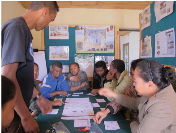
Figure 6. Wetland discussion game: regional authorities implementing a self-developed rule during testing phase.

users but also school children, and judged the game to be realistic, instructional, enjoyable, and suitable to enter into fruitful discussions. It still remains to be tested whether this game approach can increase the acceptance of already existing conservation rules in the real Alaotra socioecological system.