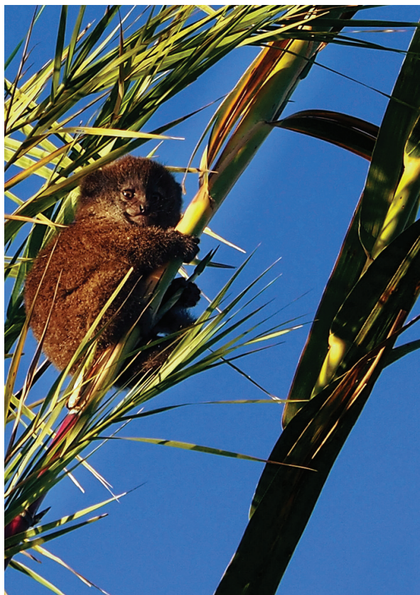
Figure 2. A juvenile Hapalemur alaotrensis , with permission from photographer Arnaud De Grave, Le Pictorium Agency.

social behavioral trait common in many lemurs [54], and has a specialized diet based on marshland vegetation only [53] and it is well adapted to wetland conditions [51]. Hapalemur alaotrensis is the only primate species in the world that lives exclusively in a wetland habitat. The species is classified as Critically Endangered [55] due to its very restricted geographic range. Hapalemur alaotrensis is at high risk of extinction due to rapid and ongoing habitat destruction for conversion of the marsh to rice fields [56]. The marshland coverage was around 19,000 hectares in the early 2000s and it has decreased to below 14,000 in the mid-2000s; in 2012, there was an extreme fire year affecting more than 50% of the remaining marshes [57]. There are two factors leading to increased marshland burning: lack of law enforcement and prolonged drought seasons. For example, a single rice field was found within the Park Bandro at Andreba in 2013, but this increased to five rice fields in 2014. People in Andreba stated that they will transform the marsh into rice fields if the current delinquents are not punished. A census of Madagascar Wildlife Conservation (MWC), a Malagasy NGO, revealed that in 2016, a fourth of the park was covered with illegal rice plantations [58].