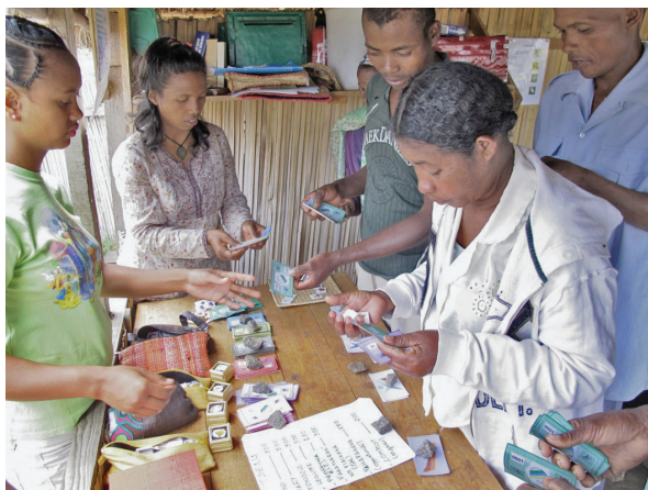
Figure 3. Wetland research game: players buy activities at the market.