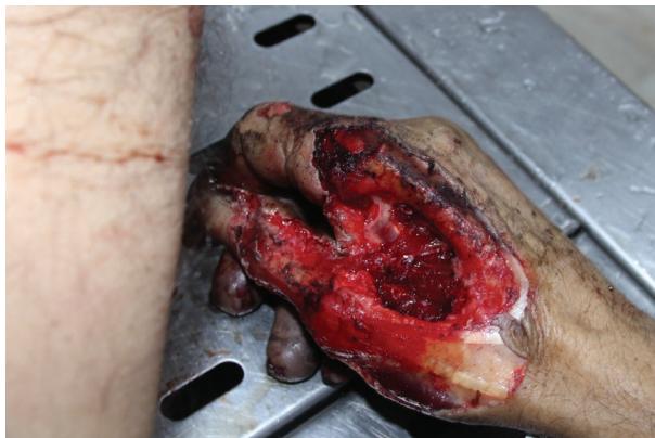
Figure 4. Soft tissue defect of the right hand due to postmortem rodent activity. Irregular wound margin and disclosed underlying muscle and tendon.

the hamster made up of these paper towels, pea-shaped tissue and muscle fragments were detected. When the rodent has enough time for feeding, it devours naked, unclothed, easily accessible parts of the body such as face and arms, till bones, ( Figure 5 ) and this situation may create problems in identification of the victim. In the author's own case, a 75–80-year-old solitary woman in bad socioeconomic status was found dead at home. Widespread soft tissue and muscle loss on face, neck, and upper extremities that exposed the underlying bone tissue were observed. Both of her hands were amputated from the wrists. On the edges of the wounds, teeth marks peculiar to rats were detected, and pneumonia was implicated for her cause of death [75] ( Figure 6a, b ).