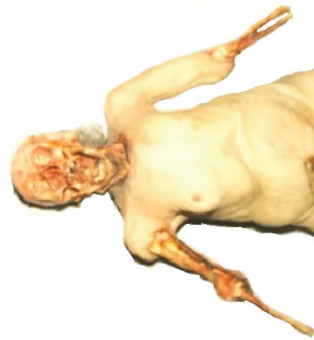
Figure 6. The incident site of the corpse of a 75–80-year-old woman who was living alone in low socioeconomic level is shown in (a). Amputated hand, extensive soft tissue, and muscle loss that exposed bone tissue of head, neck, and upper extremity caused by postmortem activity of rodents are seen in (b).

the places where skin integrity is disrupted or eroded. If the corpse is exposed to penetrating trauma during perimortem period, then birds frequently focus on this injured region, and a large round hole may occur due to feeding [76]. In a study on the most known scavenger bird, namely vultures, it was reported that vultures observe the corpse for 24 hours before feeding on it, and during 4–5 hours of active feeding period, they can skeletonize the corpse [80]. Conversely, in an observational study, Beck et al. [5] left pig carcasses in an open field and indicated that vultures had started to feed on the corpse 17 days later, which they attributed to raining that suppressed the spread of odor of the carcass. In addition, some studies with 37 days of follow-up period have been also cited [39]. If crows and magpies want to feed on larvae in cancellous bone, they will remove outer cortical layer of the bone and cause cone-shaped lesions in the cancellous bone. These cone-shaped lesions caused by beaks of the birds do not demonstrate any symmetry. These lesions are haphazardly placed, and frequently they overlap. Destructive changes seem to focus on a certain area. Birds focus on an area of soft tissue to create a round hole, and also they target a certain part of the bone, remove the