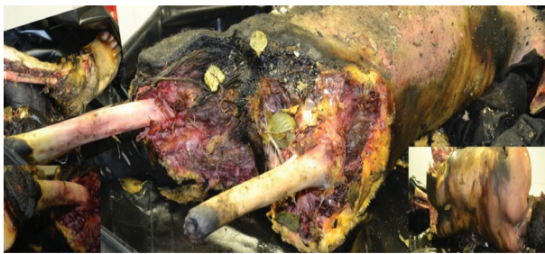
Figure 8. A corpse of a 17-year-old man who died because of stabbing and was burned after death. Amputated left limb, extensive soft tissue, and muscle loss that exposed bone tissue of lower limbs and hip caused by postmortem Canidae scavenging activity.

soft tissues of the forearms, hips, thighs, and abdominal region and left multiple puncture marks on the ulna and radius with an attempt to disarticulate the arm. Besides, it was demonstrated that lynx tried to hide the corpse with a heap of mud, grass, and pine needles after it consumed the corpse for future feeding process, which might create complications as for the identification of the corpse by forensic medicine and forensic anthropology. Bears are one of the biggest carnivorans, which cause postmortem injuries [40]. Carson et al. [40] indicated the presence of significant differences in scavenging models of bears and canid family and argued that discrimination between bears and dogs based on the presence or absence of remains of human skeletons found in and around the incident site is possible. Bears usually devour axial skeleton and tend to consume, extract, or damage vertebrae, ribs, and sternum, while members of the canid family frequently damage extremities and through opened body holes devour internal organs incurring little injury on vertebral column. If only skeletal tissue was left behind because of scavenging activity of carnivores, the attacking animal may be identified looking on the length and width of the bite marks on the bone [33, 34]. It has been claimed