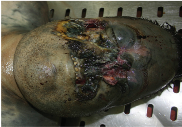
Figure 7. Common soft and muscle tissue loss on right cheek, nose, and upper lip due to postmortem Canidae scavenging.