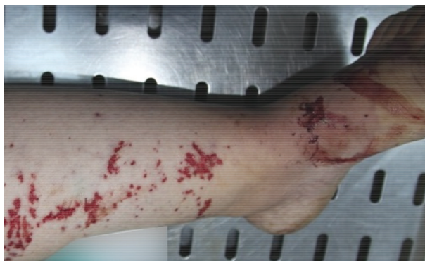
Figure 1. Serpiginous, parchmentized, and irregular-shaped superficial skin lesions were associated with postmortem ant activity on the left leg (Archive of Council of Forensic Medicine, Turkey).