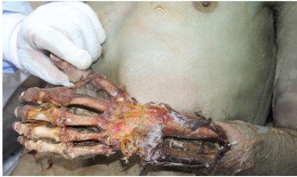
Figure 5. Widespread muscle and soft tissue loss disclosed skeletal tissue due to long-term postmortem rodent activity.