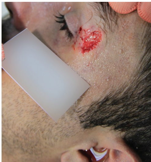
Figure 9. Soft tissue loss of 2 \times 1 cm with semilunar-shaped notches of 0.1 cm in the edges due to postmortem small fishes scavenging on the left temple.

Sea lice ( Natatolana woodjonesi ) are isopods nearly 2.5 cm in length that live on sand surface and in shallow waters. They move actively when they search for food [2]. Sea lice may surround corpses immersed in ocean very rapidly. Under appropriate conditions, they can quickly