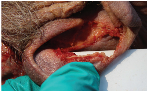
Figure 3. Soft and cartilaginous tissue loss due to postmortem rodent activity in right ear and irregular serrated appearance at wound edge.

activity has been reported more frequently in lower socioeconomic living conditions and among homeless people [26]. At the incident site, the presence of rodent feces should suggest postmortem rodent activity [9, 13]. Especially when indoor postmortem rodent interference is suspected, searching for rodent nest at the incident site facilitates establishment of accurate diagnosis [13, 74]. Ropohl et al. [74] presented a case of a 43-year-old woman whose hip and lower abdominal and genital regions were naked, which raised the suspicion of a sexual assault. At the incident site, widespread tissue defects on the face of the victim and rodent feces and in a drawer a golden hamster wrapped in paper towels were found. In the nest of