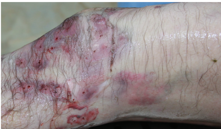
Figure 10. Oval, hemorrhagic lesions of 0.2 cm in diameter in the middle of red-colored ecchymosis of 1 cm in diameter due to postmortem small sea creature scavenging.

Sea stars live on the seafloor and cannot swim actively. During early postmortem period, sea stars cause development of hematomas by sucking action, which may be easily confused with antemortem hematomas. However, the discovery of a sea star on the corpse demonstrates that the corpse had remained at the seafloor for a while [2].