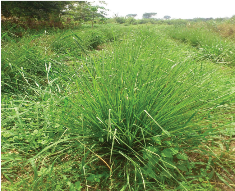
Figure 1. Vetiver ( Vetiveria zizanioides L.) grass strips at the University of Ibadan, Nigeria.