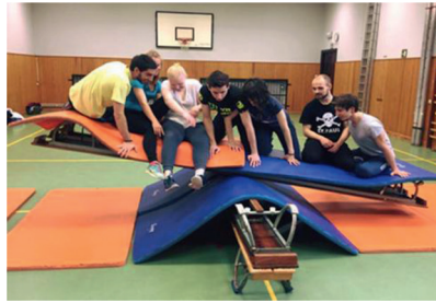
Figure 2. The seesaw: a group activity in psychomotor therapy.

goal. Other group members intrude into their comfort zone, and the patients are confronted with body contact. For some patients, this is a stress situation. How can they cope with this stress?