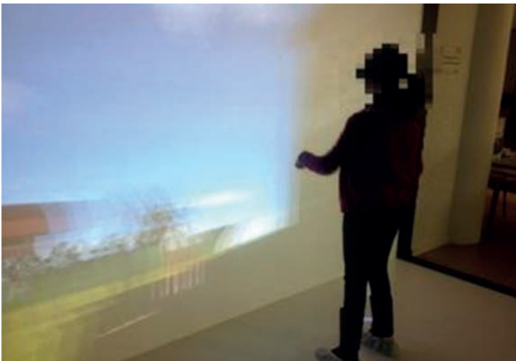
Figure 5. Student from the secondary educational stage performing one of the social stories in the immersive virtual environment.

An evaluation using the PIAV protocol took place while the tasks described above were carried out: body motor coordination control; voice control; look control; attention control; and empathy control. The discussion groups created by the participating teachers on a monthly basis assessed the evolution of students' behaviour in the school tasks, which resembled those undertaken in immersive environments.