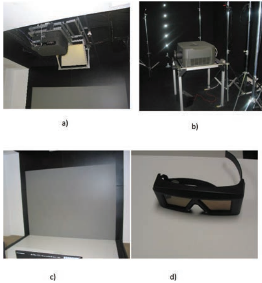
Figure 1. Elements of the virtual reality room. (a) and (b) Projectors, (c) 2 screens in an L shape, and (d) virtual reality glasses.

By way of example, Figures 3 and 4 show some of the immersive virtual environments created.