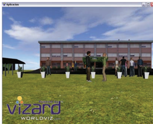
Figure 4. Immersive environment: playground of a secondary education school.

used to deal with their difficulties in social skills and executive functions such as emotional competences; in turn, students with similar characteristics formed the experimental group, but their intervention took place in the immersive learning environments designed. The sample was shaped in the first stage with 10 primary education students from public schools located in the city of Alicante (Spain) and a second group of 10 students from secondary schools also located in Alicante; and in a second stage, with 20 randomly chosen children who had to carry out the tasks in the IVRS and a second group, the control group, 20 children, chosen randomly, will carry out the tasks in the VR.