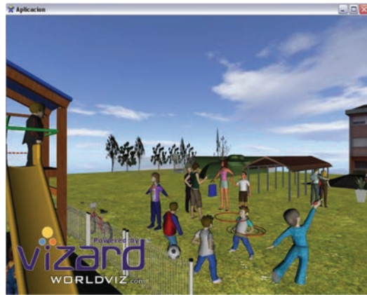
Figure 3. Immersive environment: playground of a primary education school.