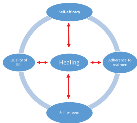
Figure 2. Proposition model of the relationship between the constructs affecting the quality of life and the healing of venous ulcers.

Other constructs with QOL and healing are also investigated, including self-efficacy, adherence to treatment and self-esteem. Figure 2 demonstrates this interrelationship.