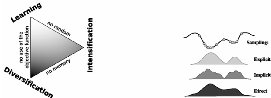
Figure 1. The three classes of metaheuristics proposed in adaptive learning search are defined according to the sampling of the objective function. They combine themselves with the three archetypal components, that form the set of possible behaviours