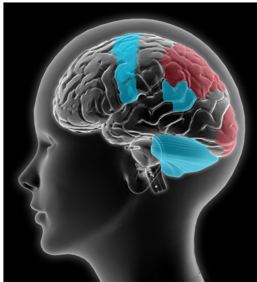
Figure 3. Schematization of brain activations during visual and kinaesthetic imagery. During kinaesthetic imagery (blue), the pattern of activity involves motor-related regions mainly, including cM1, PMC, SMA, cerebellum and basal ganglia (hidden from the view), as well as in the inferior parietal cortex. In contrast, more activity is observed during visual imagery (red) in occipital regions and superior parietal lobule, including the precuneus.

activations during visual imagery and kinaesthetic imagery of complex hand movements. Visual imagery activated predominantly the visual pathways including the occipital regions and the precuneus, whereas the pattern of kinaesthetic imagery involved mainly motor-associated structures and the inferior parietal lobule (Figure 3). These data support the hypothesis that visual imagery of a motor sequence refers to the visual properties of visual perception, while kinaesthetic imagery includes in greater extent motor simulation processes related to the form and timing of actual movements (Michelon et al. 2006). Although visual and kinaesthetic imagery shared common brain structures, these data provide strong evidence that the patterns of neural activity mediating the ability to perform a specific MI type are partially different. Practically, it might suggest that participants are able to favor one sensory modality to form mental images, although MI is a multimodal and multidimensional construct.