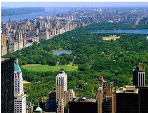
Figure 2. Central Park, NYC