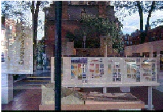
Figure 1. Eco-revelatory design exhibit

Thirty years ago, in Design with Nature , McHarg proposed a system of ecological inventories to help explain the way natural processes may influence regional and urban planning and design [6]. Also, it makes the case for an ecological approach to design. McHarg gave a new dimension to the historical goal of 'imitating nature' (mimesis). He was concerned both with