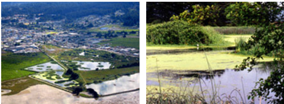
Figure 5. The Arcata Marsh and Wildlife Sanctuary

Arcata Marsh is one of the ERD examples of today design approach. The Arcata Marsh and Wildlife Sanctuary was constructed in 1981 (Figure 5). The City of Arcata incorporated wastewater treatment to the system in 1986. The City of Arcata's unique wastewater treatment facility, marsh, and wildlife sanctuary attracts approximately 150,000 visitors per year [8]. Arcata's wastewater treatment plant is an example of a community involvement in environmental politics, innovative uses of land, and applications of appropriate technology in a small urban community. The Arcata Wastewater Treatment Plant combined with the Arcata Marsh and Wildlife Sanctuary has multiple uses, including wastewater treatment, recreation, wildlife habitat, education, and research. The residents of Arcata who stroll by the wetland can, for instance; see that wastewater treatment wetlands can be important habitat for fish and birds, as well as an energy-efficient, biologically based method of controlling water pollution. The experience of the Arcata wetland shows that ecological processes can be brought into a constructive partnership with human settlements.