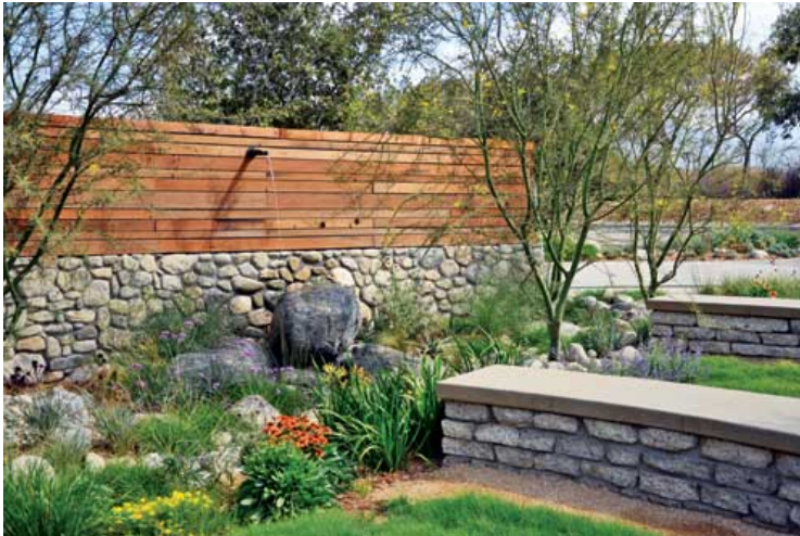
Figure 6. The Storm Garden of Gateway Business Center

The storm garden is irrigated by the adjacent rain harvesting tanks. A natural wash picks up excess rainwater and roof water not captured by the parking lot bioswale. [9] (Figure 6)