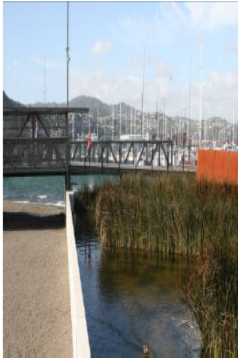
Figure 9. Stormwater management- the use of native plants

on stormwater garden (Figure 9). It gives opportunity to people to have information about their native plants. Native trees and shrubs mimic the adjacent natural riparian areas, native plant communities and wildlife habitat. Natural water sources and planting zones will be considered when choosing plant material to minimize the need for irrigation.