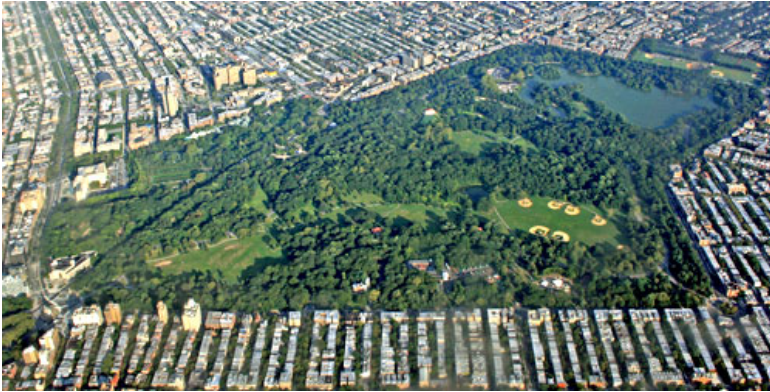
Figure 3. Prospect Park in Brooklyn

In the second half of the 19th century, Frederick Law Olmsted completed a series of parks which continue to have a huge influence on the practices of Landscape Architecture today. Among these were Central Park in New York City (Figure 2), Prospect Park in Brooklyn (Figure 3), New York and Boston's Emerald Necklace park system (Figure 4).