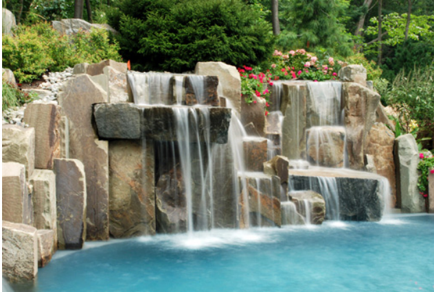
Figure 7. Artificial Waterfalls