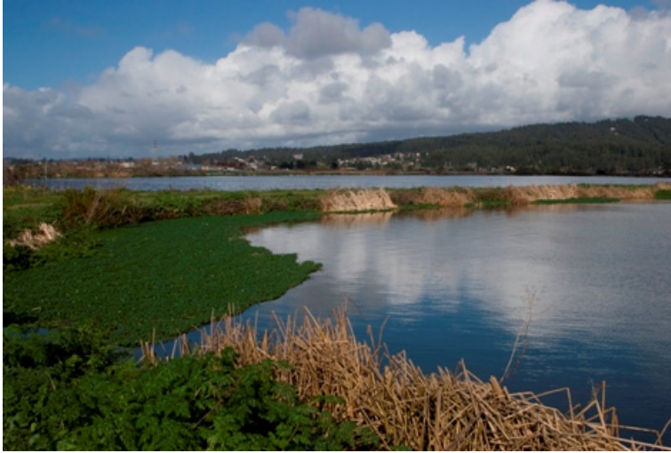
Figure 8. An Oxidation Pond at the Arcata Wastewater Treatment Plant