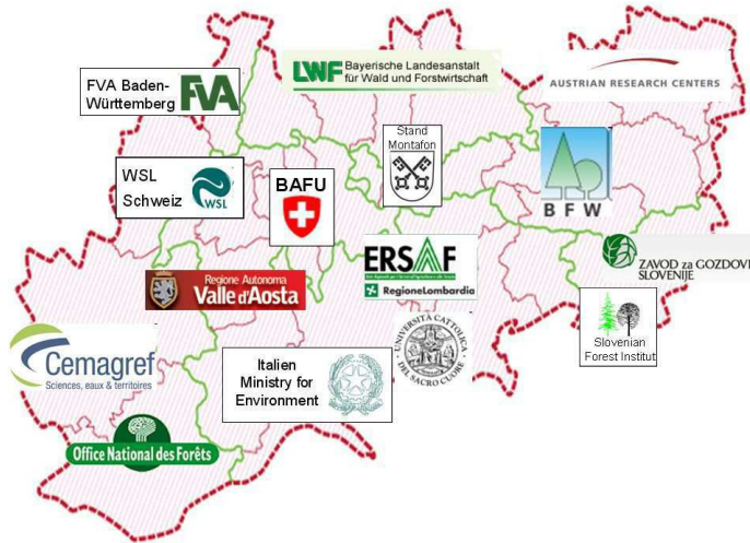
Figure 1. Geographical distribution of the partner institutions of the Interreg project “MANFRED - Management strategies to adapt Alpine Space forests to climate change risks”.

The forests have a dual function within climate change. They are contributing to the mitigation of climate change, and their adaptation to climate change effects ensures their sustainable development under future site conditions. When the conservation of the huge carbon stock of forests in the Alpine Space is on the agenda, it is necessary to enhance the resilience of forests. Many forests, particularly in mountains, are going to benefit from climate change effects in the near future. Their productivity is currently limited by the duration of the growing season, which is expected to be elongated in the future. However, climate change is expected to manifest itself in many ways and the increase in the temperature is only one aspect. The rising CO 2 level affects the growth rate as well and altered temporal patterns of drought, mortality, and disturbances are to be taken into account. Moreover, the nitrogen supply has been increasing in the last decades and may in some regions exceed the demand of forests [10, 11]. Superimposed on these effects are potentially adverse effects such as extreme meteorological events, ecosystem disturbances, air pollution, and an increasing pressure from pests and pathogens on forests.