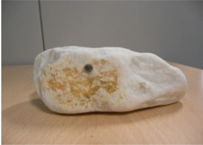
Figure 3. A Smart Pebble. On its surface is possible to notice the hole housing the transponder

The first experimentations on the Smart Pebble system were carried out in 2009 and this solution has been since then employed in several on-site applications on different beaches in Italy. The effective use of the system has roughly confirmed the results recorded in the laboratory tests: during the localization process, the transponders embedded inside the pebbles were localized even from distances higher than 50cm.