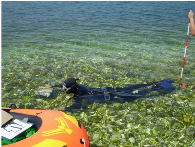
Figure 4. A moment of the localization operations