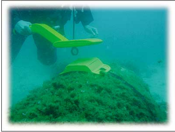
Figure 2. The Enertag system for the pipeline monitoring