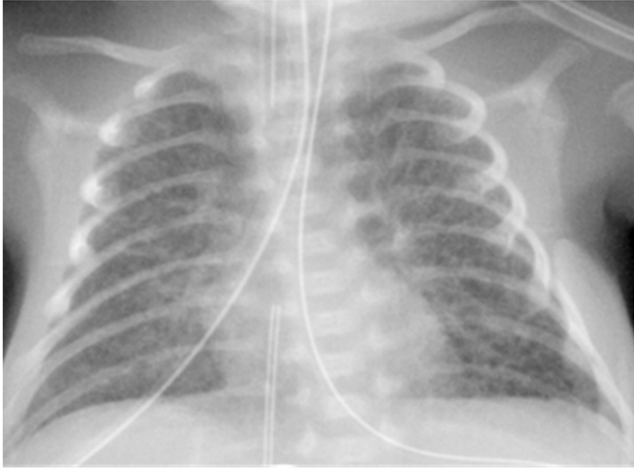
Figure 6. Streaky-patchy lung changes with partly cystic appearance in Ureaplasma urealyticum pneumonia on day 6 of life (Case 4)