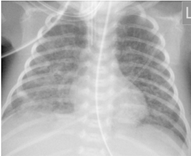
Figure 5. Bilateral lung infiltrates with consolidation mainly in the middle and right lower lobe in Enterobacter pneumonia (Case 3)

A female infant was born to a primigravid mother at 28+1 weeks of gestational age. Delivery was by cesarean section due to a pathological cardiotocogram and presumed maternal infection (preterm premature rupture of the membranes 9 hours before delivery, preterm labour, increased neutrophile count and elevated CRP). The mother was treated with