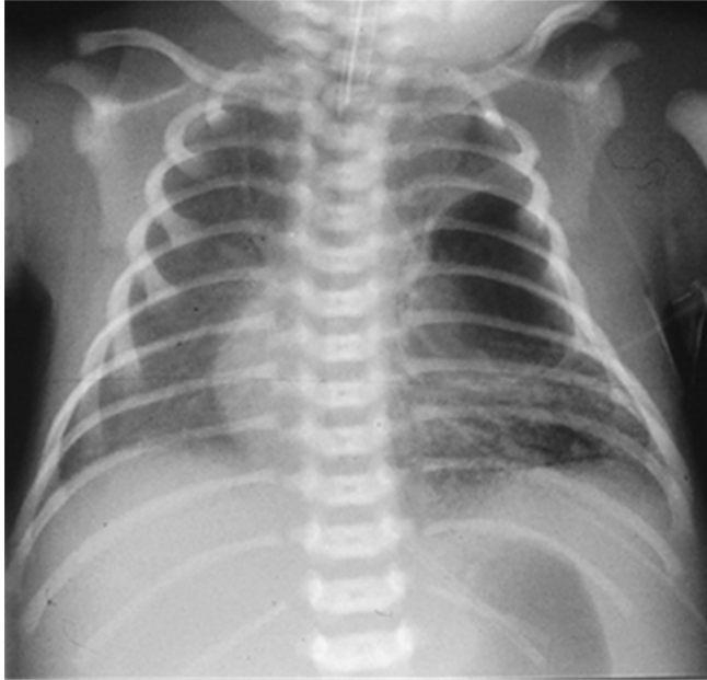
Figure 2. Pneumatocele formation on the leftside and streaky-granular infiltrates in Group B Streptococcus pneumonia (Case 1)