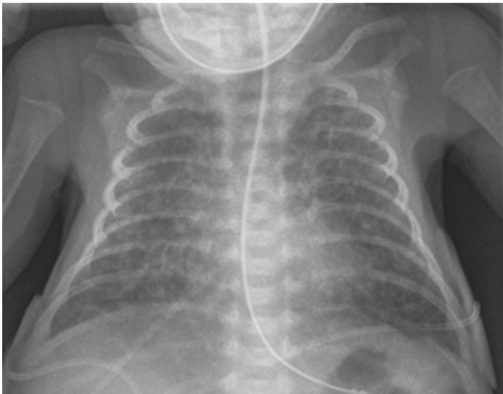
Figure 7. Early BPD changes in Ureaplasma urealyticum pneumonia on day 18 of life (Case 4)