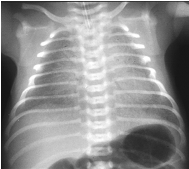
Figure 1. Bilateral reticulogranular lung pattern in Group B Streptococcus pneumonia mimicking RDS (Case 1)