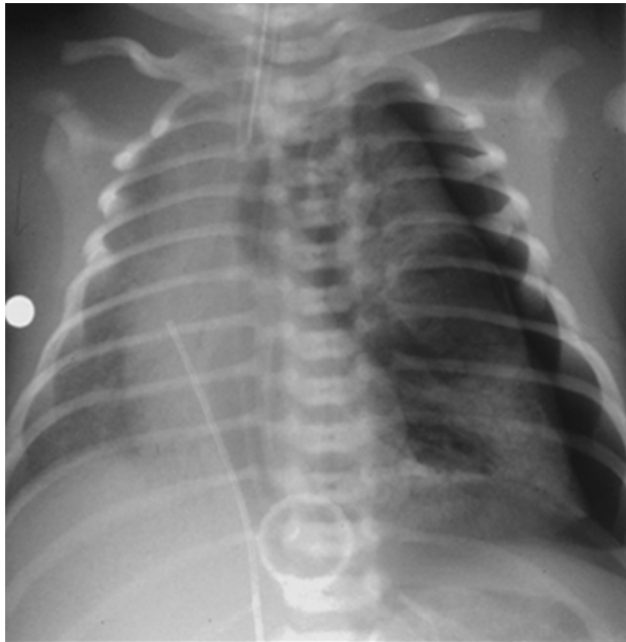
Figure 3. Leftsided tension pneumothorax complicating Group B Streptococcus pneumonia (Case 1)