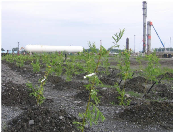
Figure 8. Phytoremediation using willows on a former oil refinery around Montreal

Phytoremediation using willows is becoming an increasingly popular alternative approach to decontamination, and several studies and pilot projects are underway. Willows have been used successfully to treat highly toxic organic contaminants such as PCBs, PAHs, and nitroaromatic explosives [87]. Similarly, willows, in particular S. viminalis and S. miyabeana , have been shown to accumulate Cd and Zn in their stems and leaves while sequestering Cu, Cr, Ni and Pb in their roots [85,88,89,90]. In previous studies, the efficiency of willows in short-rotation intensive plantation for the elimination of heavy metals contained in wastewater sludge has been investigated [28, 59, 90]. We have also found that willow may be useful for improving sites polluted by mixed organic-inorganic pollution [91] (Figure 8).