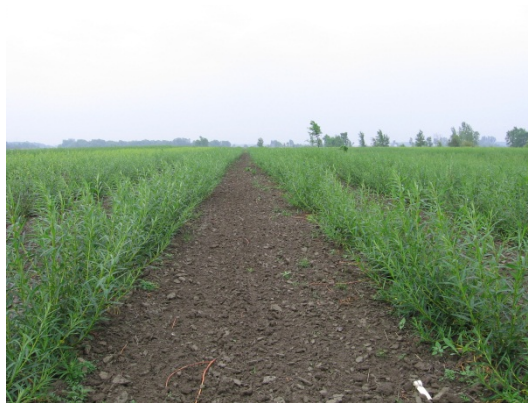
Figure 3. After cutback willows sprout vigorously from the stumps

There is much evidence that most newly-established willow plantations profit immensely from being cut back at the end of the first growing season (Figure 3).