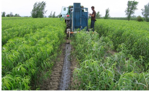
Figure 4. Pig slurry application to a willow plantation

production conditions. This means that even though nitrogen in slurry may be less efficient than that in a mineral fertilizer, a significant reduction in the production costs of willow-based biomass as well as recycling of a greater quantity of slurry can be achieved simultaneously [54].