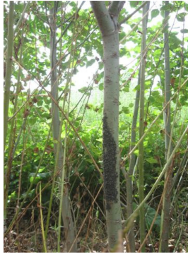
Figure 5. Giant aphids feeding on willow. This insect is often found forming large colonies at base of the stem.

stem surface of a willow tree. Laboratory experiments with willows grown in soil and in hydroponic culture have revealed that this species can reduce the above-ground yield of biomass willows, have severe negative effects on the roots and reduce the survival of both newly planted and established trees [63]. Other preliminary studies carried out in the UK have shown that this insect's feeding behavior is affected by chemical cues from the host. Researchers found that one of its most preferred willows was S. viminalis [64]. Although large colonies of this insect have recently been found on several willow varieties in Quebec, it is not yet possible to estimate its threat to willow plantations in this region (Figure 5).