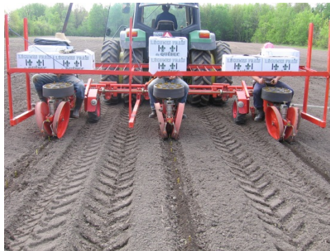
Figure 1. Willow planting machine operating on 3 rows simultaneously

Planting material consists of dormant willow stem sections, either rods or cuttings, depending on the planting machinery to be adopted. In some countries, for example in the UK and in the USA, 'step planters' are the most commonly used machines. Willow rods 1.5-2.5 m long are fed into the planter by two or more operators, depending on the number of rows being planted. The machine cuts the rods into 18-20 cm lengths, inserts these cuttings vertically into the soil and firms the soil around each cutting. Step planters have been calculated to cover 0.6 ha/hr in a UK study. [31]. In Quebec, the most common planting machine is a cutting planter that uses woody cuttings (20-25 cm long) and may operate on 3 rows simultaneously (Figure 1).