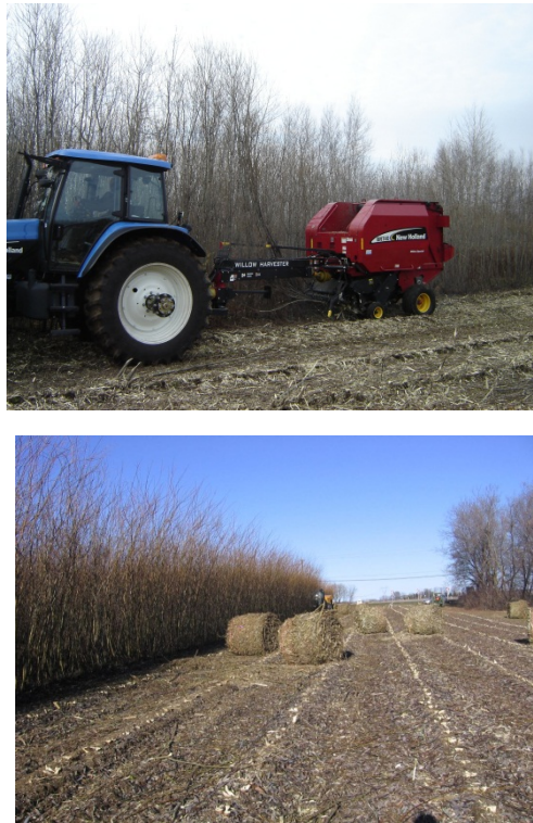
Figure 6. Willow cutter-shredder-baler harvester operating in Quebec

A third harvest system recently developed in Canada, mainly adapted to willow short-rotation coppice, is a cutter-shredder-baler machine that performs light shredding and bales willow stems [22], producing up to 40 bales hr -1 (20 t hr -1 ) on willow plantations (Figure 6).