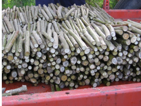
Figure 2. Willow cuttings before planting

wood) are selected to prepare cuttings. Tips of stems bearing flower buds are first discarded. Then the rest of the whip is cut into 20-25 cm lengths using an adapted rotary saw and stored in boxes, ready to be planted (Figure 2).