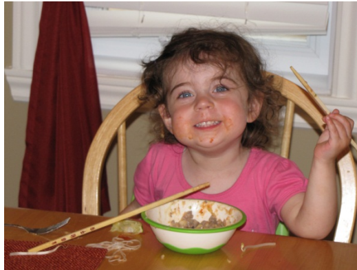
Figure 1. Children learn about food through exploration with their senses

tensities of these aversive reactions may lead to food refusals that may get generalized to foods with similar characteristics or to all new foods. Some children are so sensitive to the sensory characteristics of the rejected food that they will not eat any other food that comes in contact with the refused food, or refuse that certain foods be placed in their line of vision, or refuse to eat when others, seated next to them, eat a food that has been rejected or it may trigger an aversive reaction (Figure 1). What distinguishes Sensory Food Aversions from normal food preferences is the degree of severity of the food refusal and the presence of nutritional deficiencies or oral-motor delays arising from a lack of exposure to more demanding food textures [33]. Some studies have shown a significant relationship between food selectivity or mealtime problems and problems with sensory modulation [26, 40].