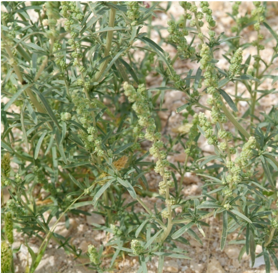
Figure 4. Oligomeris linifolia habit.

also by osmotic adjustment [15, 39] through accumulation of substantial amounts of organic and inorganic solutes like proline, glycinebetaine, sugars and inorganic ions to cope with soil of severe water shortage [3, 40-42]. Plants such as Tetraena qatarense and Ochradenus baccatus , are good examples of xerophytes having dehydration avoidance mechanism by accumulating solutes to withstand severe water stress [4]. Dehydration tolerance mechanism, on the other hand, includes some methods like avoidance of starvation strain by stomatal opening at low \Psi_w , uncoupling of photosynthesis from transpiration, low respiration rate and other secondary mechanisms include: tolerance of starvation strain, avoidance of protein loss, and tolerance of protein loss [15]. Understanding these secondary mechanisms needs extensive and deep investigation in the plants covered in this review.