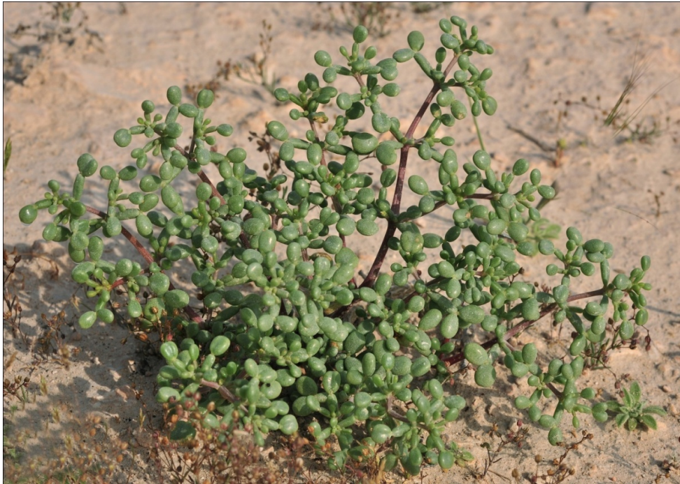
Figure 3. Branches of Tetraena qatarense with the fleshy leaves and woody stems.

in spite of its succulence characteristic and its ability to store water in different plant parts (Fig. 4). This species has been considered as a desert species suspected as halophyte. Its life form was considered as Sub-Fruticose Chamaephytes, erect fruit shoot at base [38]. It grows in various habitats, including disturbed areas and saline soils, in deserts, plains, coastline, and other places. It is a fleshy annual plant, producing several erect, ribbed stems 35 to 45 centimeters in maximum height. Although these plants are considered as xerophytes, they might have also well adapted to saline environments, since they are living in soils of high salinity levels [4].