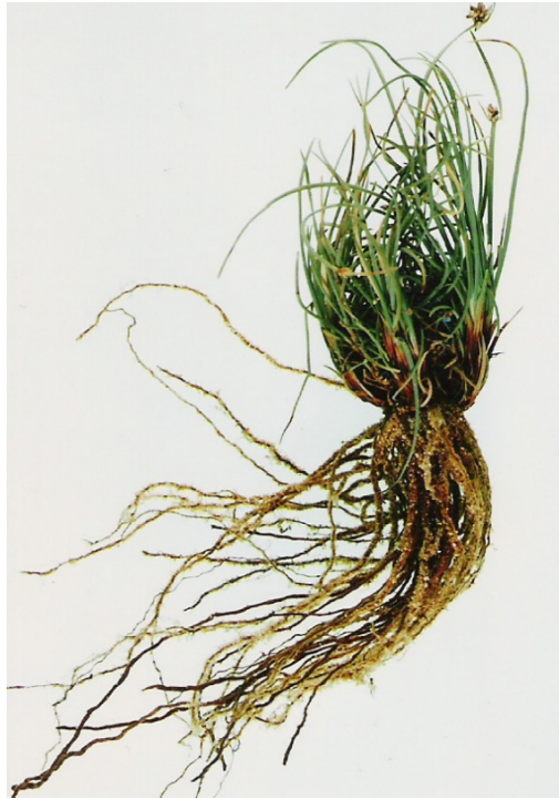
Figure 2. Cyperus conglomeratus has high root / top ratio.