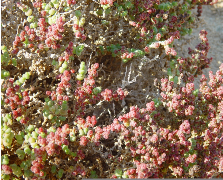
Figure 6. Halopeplis perfoliata habit.