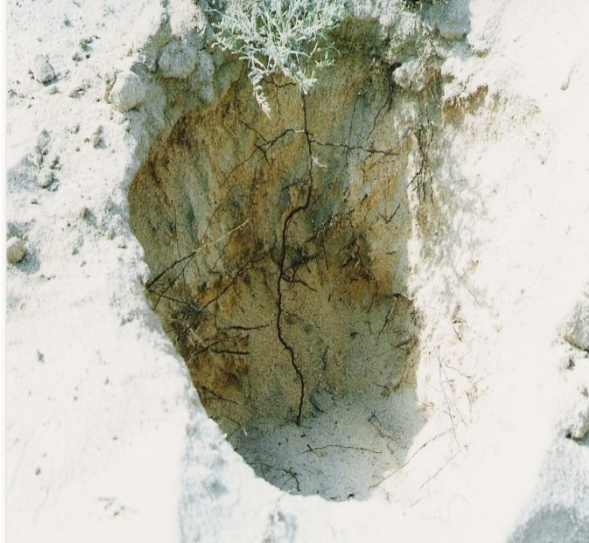
Figure 5. Some plants have roots growing in the deeper soil layers toward the water table, Helianthemum lipii .