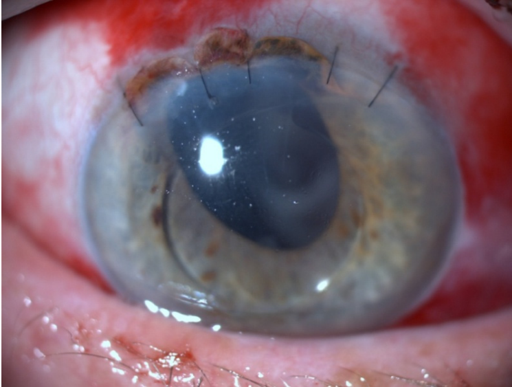
Fig. 2. Iris Prolapse