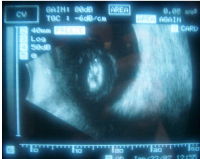
Fig. 1. Dropped nucleus

can happen in even experienced hands, and can be a worry as corrective action requires intervention in the posterior segment (Lu et al., 1999). Removing a dropped nucleus or even nuclear fragments is essential as it can either lead to long-standing uveitis, vitritis, cystoid macular oedema, and secondary glaucoma (Kaputsa et al., 1996; Lu et al., 1999).