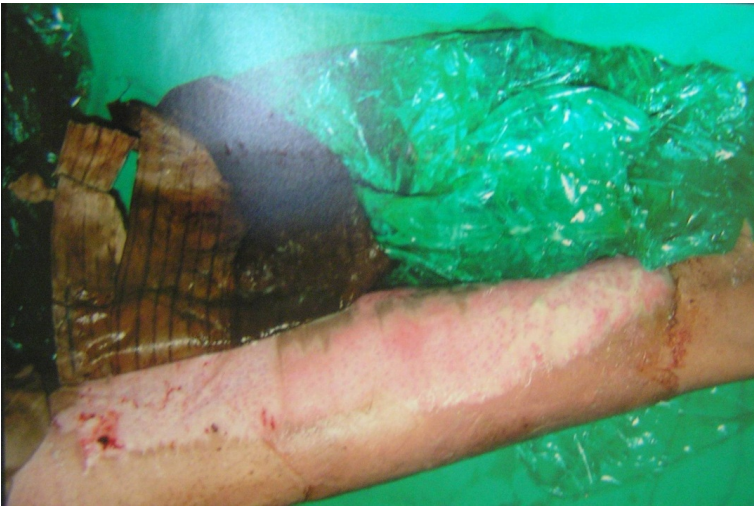
Figure 4. Epithelisation under BLD and PSD

The dressing on donor area was opened on 7 th post-harvest day, unless indicated earlier. Thereafter, the dressing was changed and area was inspected every day till complete epithelisation. (Fig 4)