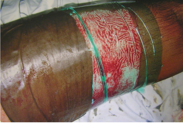
Figure 3. Application of BLD and PSD on donor area