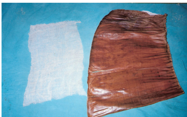
Figure 1. Vaseline impregnated gauze and autoclaved banana leaf dressing

A variety of dressings has been used for covering the split thickness skin graft donor areas. Some of these are alginates, collagen sheets, films and the most commonly used impregnated tulle gras dressing. The chief goal of management of donor area is to achieve early epithelisation without infection. Minimum pain, easy availability and low cost of dressing are other desirable criteria. A controlled clinical trial was conducted to compare Vaseline impregnated gauze and Banana leaf dressing (BLD) (Fig 1) developed at the burn unit at LTM medical college and hospital in 1997. [1] The results showed BLD to be effective with significantly less pain and at much lower cost.