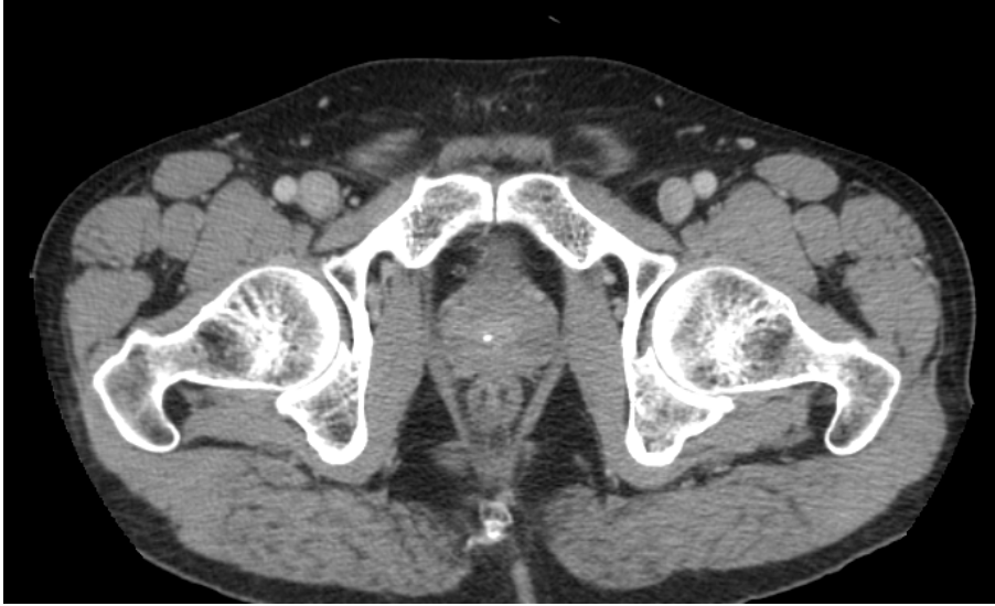
Fig. 3. Pelvic CT scan showing prostate stone in the prostate gland

prostatitis symptom scores were decreased [21]. However, there was no relationship between chronic prostatitis symptom scores and prostatic calculi or level of the histological prostatic inflammation [21].