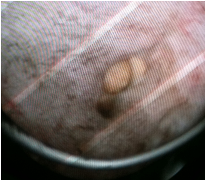
Fig. 4. Prostate stones encountered during TUR-P