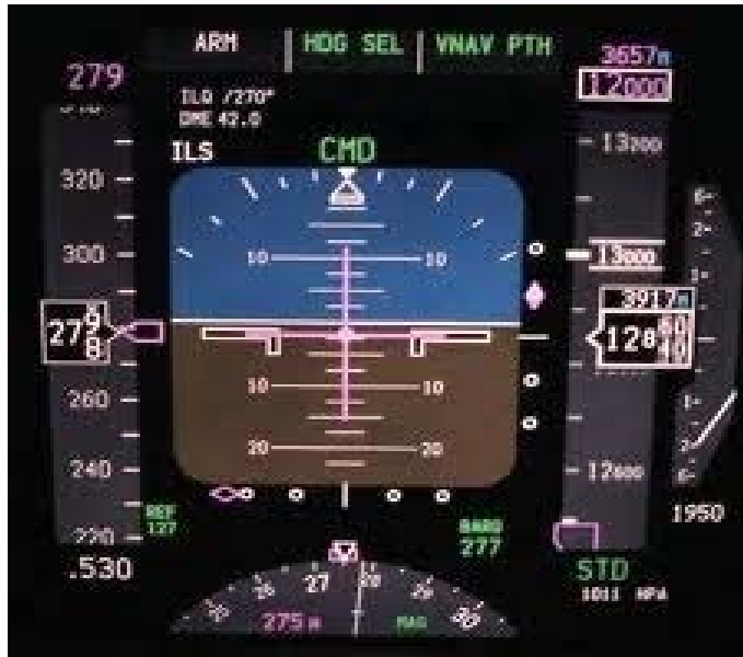
Primary flight Display

With the introduction of the glass cockpit, the traditional flight instrument display was replaced by a different presentation encompassing more information, greater flexibility, colour coding and marking, but at the same time, it could lead to information overload, as several parameters are displayed in a compact area. In a single display, known as the PFD (Primary Flight Display), multiple information is included not only for basic parameters, but also for navigation functions, approach facilities, automatic flight feedback, flight mode awareness, and so forth.