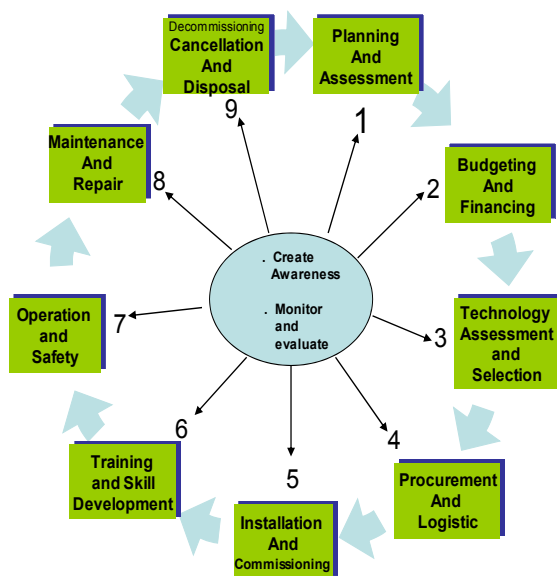
Fig. 3. The Healthcare Technology Management Cycle

The Healthcare Technology Management Cycle 11 : An example of a framework for health equipment management in developing country.