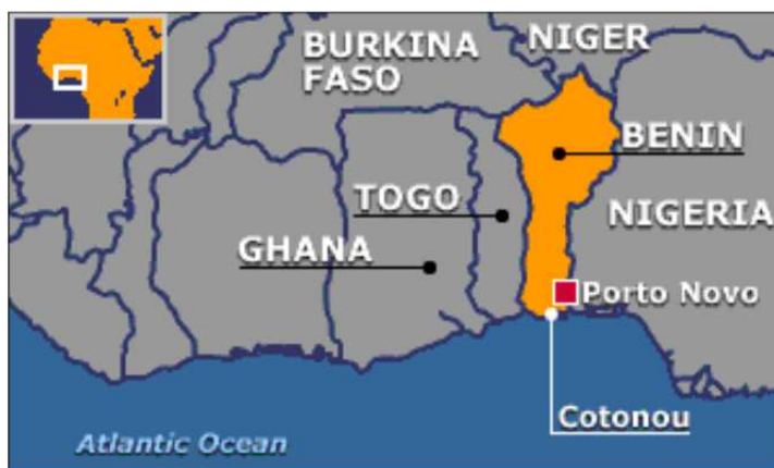
Fig. 1. Map of Benin

Located on the West coast of Africa, the Republic of Benin is small (114,763 square kilometers), with a coastline on the Gulf of Guinea nestled between Nigeria, Niger, Burkina Faso, and Togo (Figure 1). The population, estimated at 7,839,914 in 2006, includes a multitude of ethnic and linguistic groups. Benin remains one of the world's least developed countries and has been ranked 163 of 177 on the United Nations Human Development Index (2005). Demographic and health indicators are given below (Table 1).