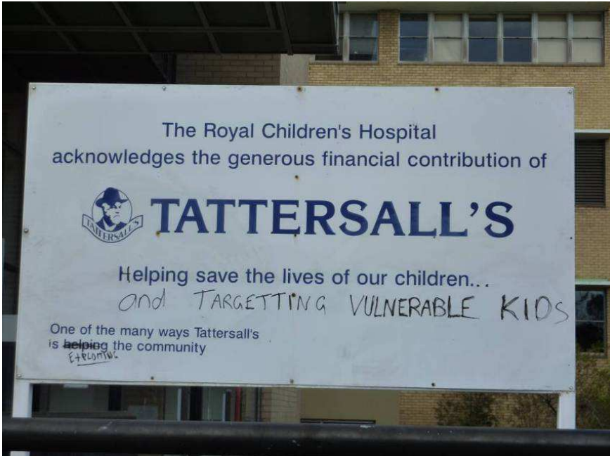
Graffiti on the sign week 2