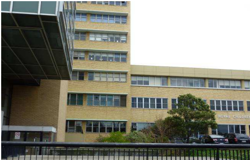
No sign (week 9)