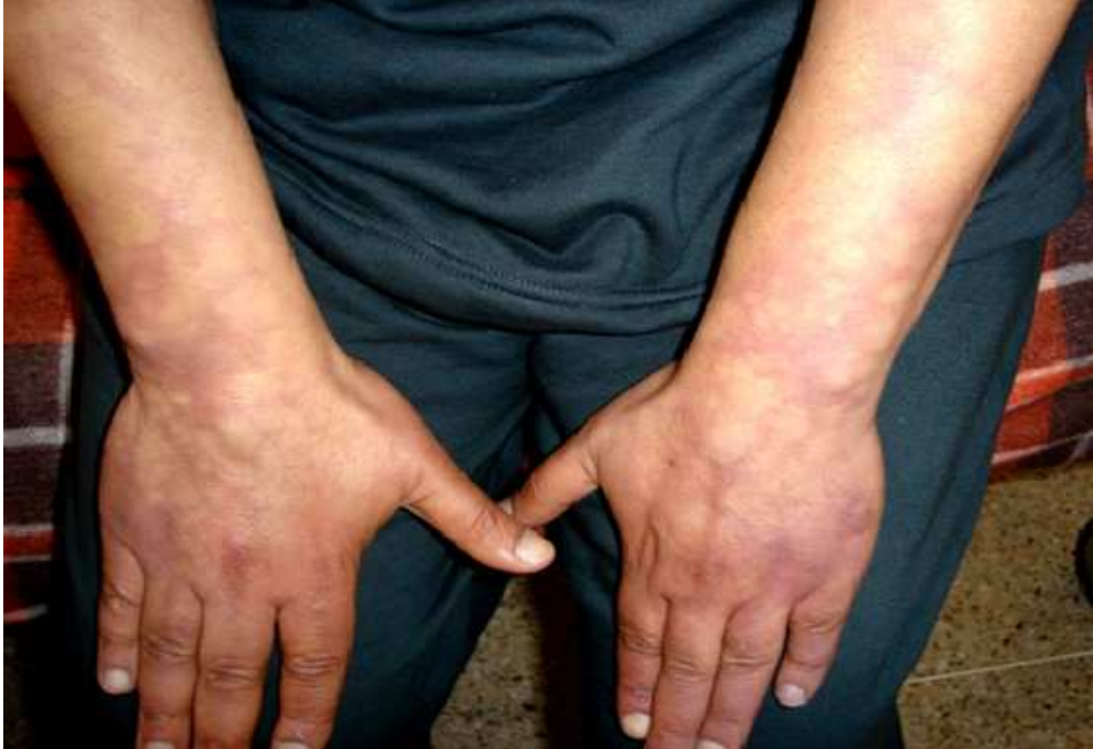
Fig. 1. Livedo racemosa affecting upper limbs in a patient with Sneddon's syndrome (personal figure)

In conclusion, seronegative Sneddon's syndrome should be distinguished from Sneddon's syndrome with aPL which should be considered as a subgroup of APS. Cognitive disorders in both Sneddon's syndrome and APS seem to be similar affecting mainly memory, attention and concentration functions. They represent sometimes the inaugural symptom in a patient without any history of known ischemic stroke. Recurrent stroke may lead to multi-infarct dementia and early retirement in young people. Prognosis depends on early diagnosis. More subtle cognitive dysfunction can be shown. These troubles are related to posterior cortical infarcts or to leucoencephalopathy. Treatment should be aggressive in case of cognitive disturbances in Sneddon's syndrome or APS.