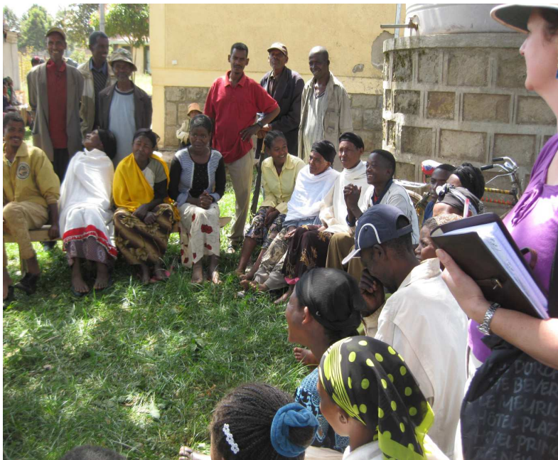
Fig. 2. A rural clinic in Ethiopia for women with podoconiosis, a condition of lymphoedema due to not wearing shoes where the soil is irritant(13). In this clinic for foot inspection, better care of the feet with significant improvement in the skin is awarded with microfinance for job development.

Some countries such as the UK(2009) (4) and USA(2006) (5), have much improved the accuracy and approach to collection of data on skin disease and its assessment and expression as a burden with needs to be met. Assessment and management in resource poor environments are now improving but still inadequately funded. In the developing and emerging countries, the education needed to ensure skilled examination and recognition of skin conditions is almost everywhere lacking. But with imported expertise some thorough analyses of the prevalence of skin disease in rural areas have been done, viz: Ethiopia,(6,7)Nepal,(8) Mali(9) Tanzania,(10) Indonesia(11) and Brazil(12.) These show a high prevalence of skin disease, usually exceeding 50% and sometimes when there are endemic conditions such as scabies, onchocerciasis, tinea capitis or lice, as much as 80% of the population, For instance, Walker's study in Nepal(8) used data from a survey conducted in five villages and found an overall point prevalence of skin disease of 62.4%. Superficial fungal infections accounted for 20%, but acne, melasma and eczema were among the top five diagnoses.