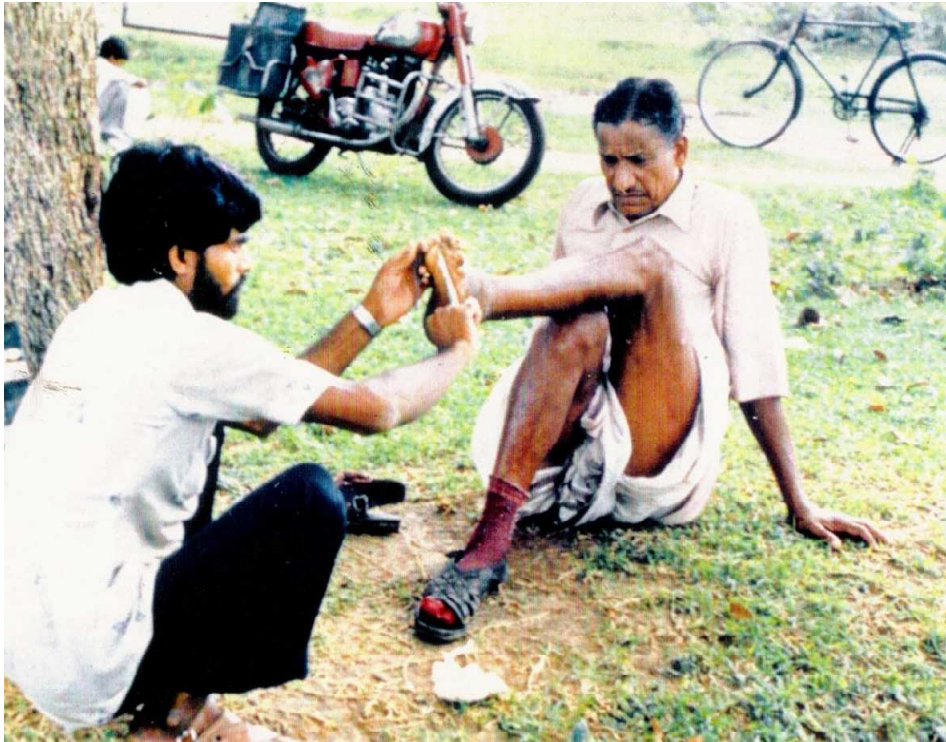
Fig. 1. A Photograph that has become a much used logo of the International League of Dermatological Societies to illustrate Healthy Skin for all(2) . Those who treat must have access, (the bike) essential drugs and devices, (in the accompanying portable case) and knowledge(appropriate education).

The nature of community dermatology, and its clear capacity to benefit, has been highlighted by the International Society of Dermatology in 10 articles published in the May 2011 edition of the International Journal of Dermatology and in a CD of 44 articles prepared for the World Congress of Dermatology held in South Korea in the same month www.intsocderm.org . The capacity to benefit within the skin care field is dependent not only on the medical profession but on an effective response from the nursing service, the largest group of health professionals worldwide. This situation is directly relevant also to both the prevention and management of chronic wounds and Neglected Tropical Diseases worldwide, given the major involvement of nurses in routine skin care and maintenance of skin integrity.