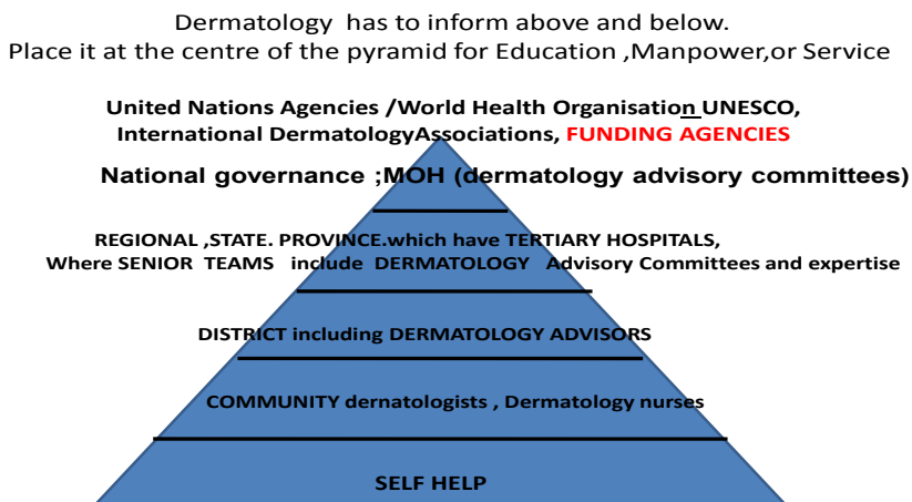
Fig. 3. Pyramid distribution of advice provided by carers of the skin must be both to Governance above as well as to practitioners below.

Experts working within the framework of a pyramid of care Fig 3 with the most needy at its base and governance at the top must give equal attention to both. At the bottom there is a need to provide locally available, sustainable, low cost care, mainly through primary care initiatives. The support of the nursing profession is crucial to this service delivery model. In the pyramid of care the Task force for skin care sits in the middle levels often collaborating with university and tertiary hospital care. For the management of prevention or first aid tertiary care extends downwards to the health centre, Traditional Health Practitioner, and to self help. For this to happen it is perhaps even more important that time is put aside for advocacy to extend upwards to those who govern health provision. So far this has resulted in little understanding of the significant role the carer of the skin plays in health care in general.