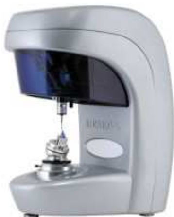
Fig. 4. Incise dental scanner (Renishaw, UK)

All results were recorded and data were analysed by means of a one-way analysis of variance (ANOVA) and student t tests for any significant differences.