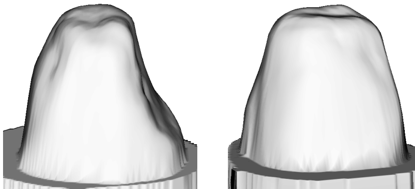
Fig. 1. Showing buccal and lingual walls (left) and mesial and distal walls (right)

The replicas of the teeth or dies are made from dental stone and these dies represent the tooth that has been prepared in the patient's mouth. The three dimensional shape has four sides and one top or occlusal surface. Two walls that oppose each other are called mesial and distal and the other two are called buccal and lingual. It is the angle formed by two opposing walls, for example between the buccal and lingual walls (in the bucco-lingual plane) which is measured as Figure 1.