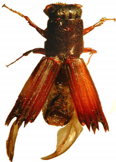
Fig. 6. Specimen of the rare platypodid Carchesiopygus dentipennis .