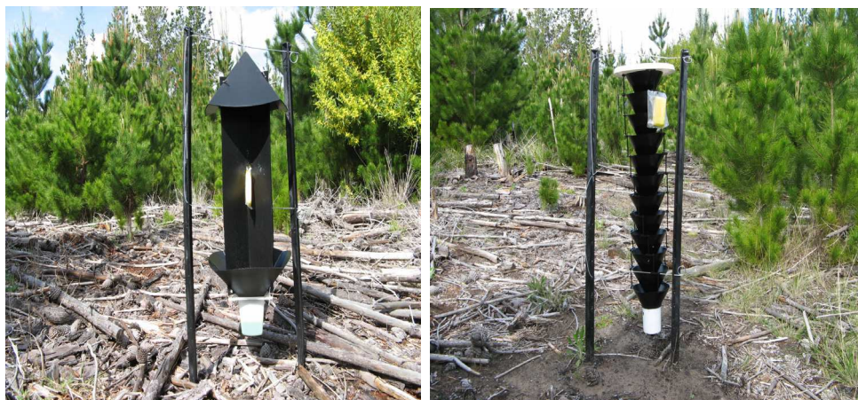
Fig. 2. Intercept panel trap (left) and Lindgren funnel trap (right).

Lindgren funnel traps, intercept panel traps, delta traps, chimney traps and bucket traps were tested against each other over a two season period using the same lures. The best performing traps in terms of both numbers of wood borers captured and number of species were the Intercept panel traps closely followed by the Lindgren funnel traps (Fig. 2).