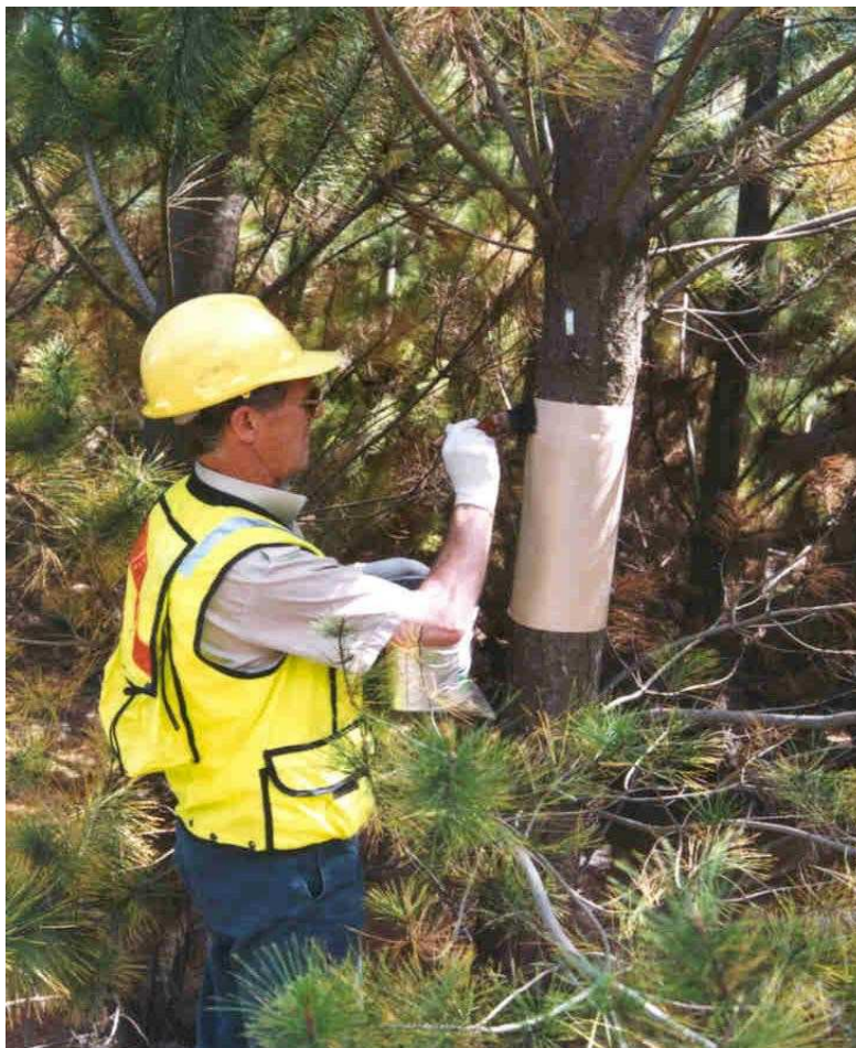
Fig. 1. Examination of sticky band trap.