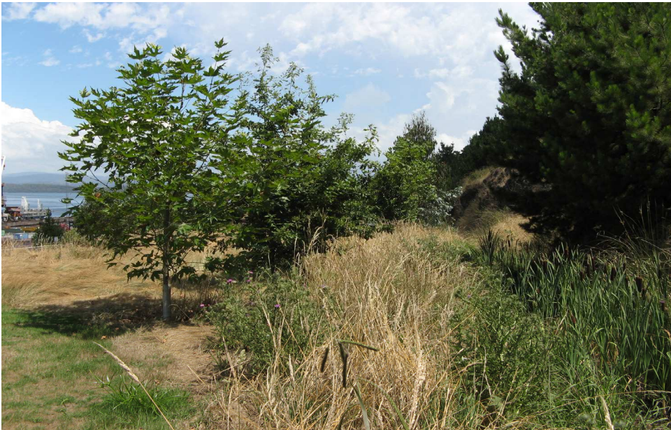
Fig. 4. Planting potted advanced growth trees for sentinel plots (upper) and established plots (lower).