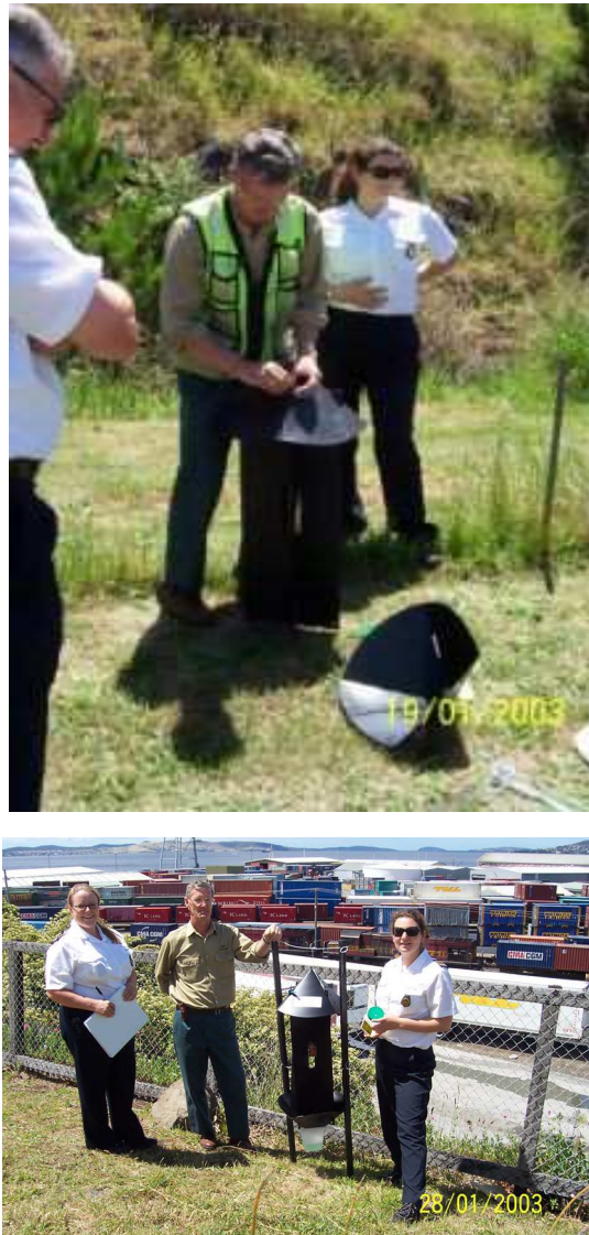
Fig. 5. Training quarantine officers in static trap assembly and set up.

Anoplophora glabripennis . To select suitable sites City Councils in each region were consulted. The knowledge of parks and gardens managers proved very useful in identifying parks, gardens and land reserves suitable for the placement of traps. The traps were serviced fortnightly from late December to late April. This servicing involved the collection of the sample jar at the base of the trap (a mixture of dilute antifreeze (propylene glycol) and detergent) and change of lure at the appropriate time. The sample bottles were packed in tote boxes and transported to the diagnostic office by public transport bus cargo.