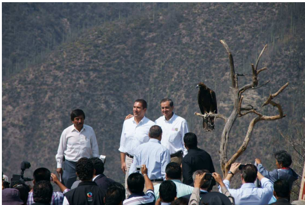
Fig. 4. Dr. Rafael Moreno Valle, Governor of Puebla State and Eng. Juan Elvira Quesada, Minister of Environment and Natural Resources Secretary, during inauguration of Natural Protected State Area "Tentzo's Sierra". At right show up the Mexican royal (golden) eagle Aquila chrysaetos canadensis.

Natural Resources Secretary, which includes nine Municipalities of the east of the region, with a surface of 145.715,8 ha., (Villarreal, 2006). On May 2, 2011, the Sustainable Environmental and Territorial Organization Secretary, of the Puebla State Government, had decreed the Natural Protected State Area "Tentzo's Sierra", which includes inside the Mixteca Poblana two north Municipalities with 15.947 ha. from the conservation and sustainable managing in to the region(Fig. 4).