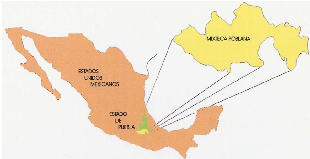
Fig. 1. Map from location of Mixteca region, Puebla State, Mexico.

population migrates principally to the New York, California and Texas states in the American Union. In the region the white tailed deer of the " mexicanus " subspecies, is distributed in 37 Municipalities by a surface of 547.550 ha. (Villarreal & Guevara, 2002).