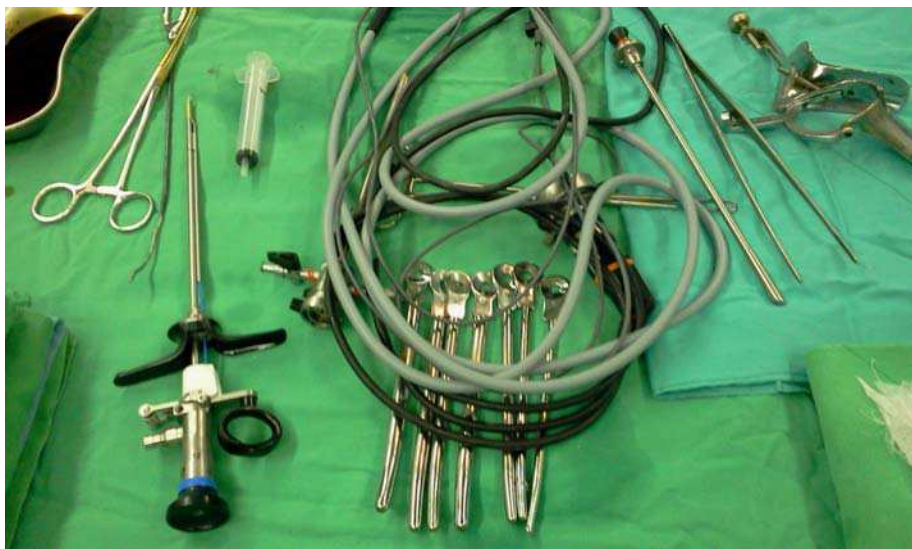
Fig. 1. instrumentation for hysteroscopic endometrial ablation include rigid resectoscope, cables, speculum, and dilators.

developed from the occurrence of Asherman's syndrome that completes destruction of the endometrium will cause amenorrhea.