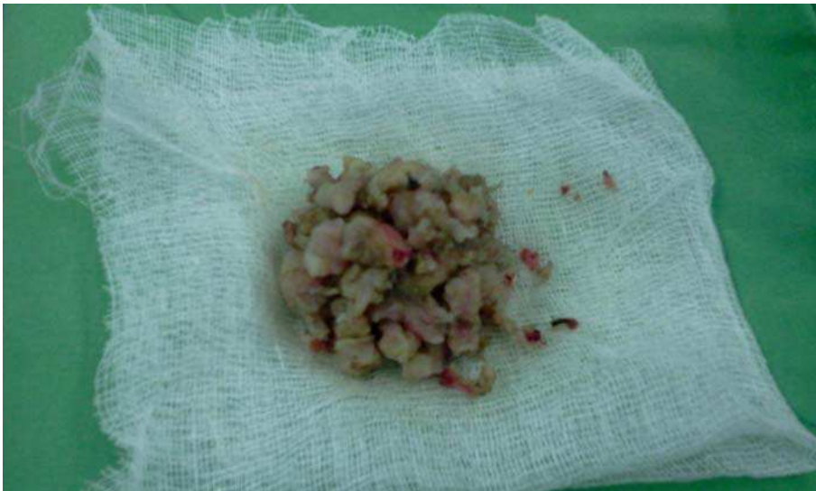
Fig. 3. Collection of myoma chips after resection.

In my series over a 15-year-period, six pregnancies occurred after the procedure, and the mean age of these women was 36 years (range, 34–40 years). Because pregnancies have been reported after endometrial ablation, patients cannot be guaranteed that this is a sterilization procedure, and the risk potential for a subsequent pregnancy must be explained and sterilization or contraception offered. Tubal ligation does not reduce distention media absorption and therefore need not be a prerequisite.