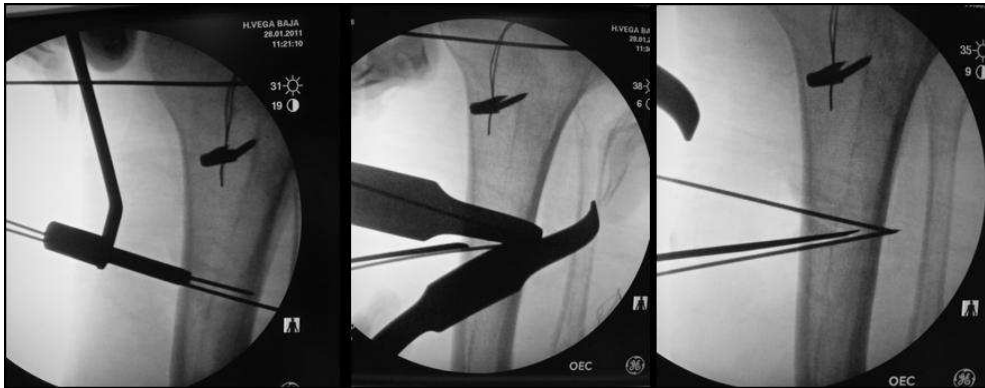
Fig. 5. Medial closing wedge TO fluoroscopic control