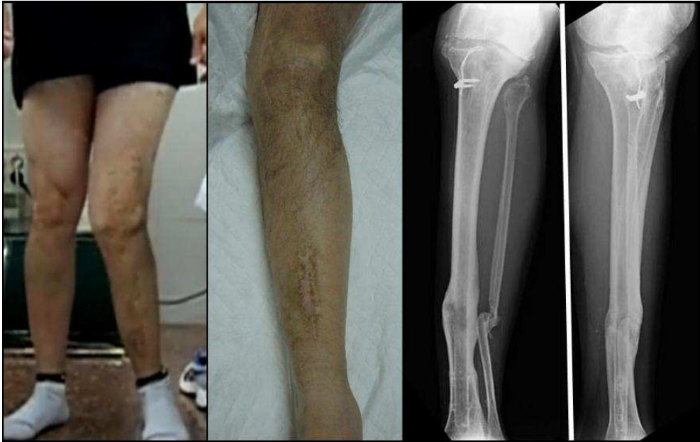
Fig. 1. Initial clinical and radiographs examination

the axes intersect is the center of rotation angulation (CORA) of a deformity. Osteotomy level and type should be considered relative to the CORA enabling us to avoid creating secondary deformities. This type of planning is applicable to both frontal and sagittal plane deformities.