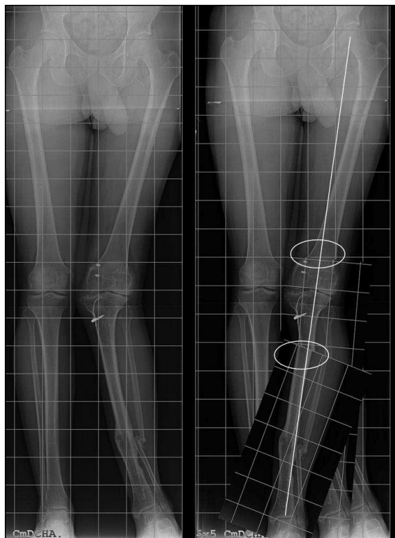
Fig. 4. Option selected: Lateral opening wedge femoral osteotomy of 5^\circ and one medial closing wedge tibial osteotomy of 16^\circ upper of the proximal CORA

Before medial closing wedge tibial osteotomy (TO) was made, a fibular transection was performed at the junction of the middle and distal thirds through a separate incision and the peroneal nerve was exposed and protected. A five to six centimetres long incision is made on the medial side of the tibia just at the level of the osteotomy, which is confirmed by placing a needle under fluoroscopic control, then we performed the TO using an oscillating saw, 8 cm below the medial joint line, bone wedge size was based on the preoperative calculations from the long leg standing radiograph (Fig 5). Finally, fixing it provisionally in position with a medial small locking compression plate (3,5mm LCP plate Synthes, Paoli, PA) and was ultimately fixed with a lateral 4,5mm LCP plate.