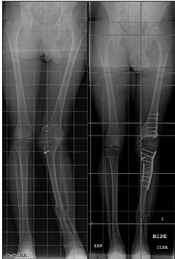
Fig. 7. Full-length standing AP radiograph of both lower extremities. Before (left side) and after (right side) osteotomies.