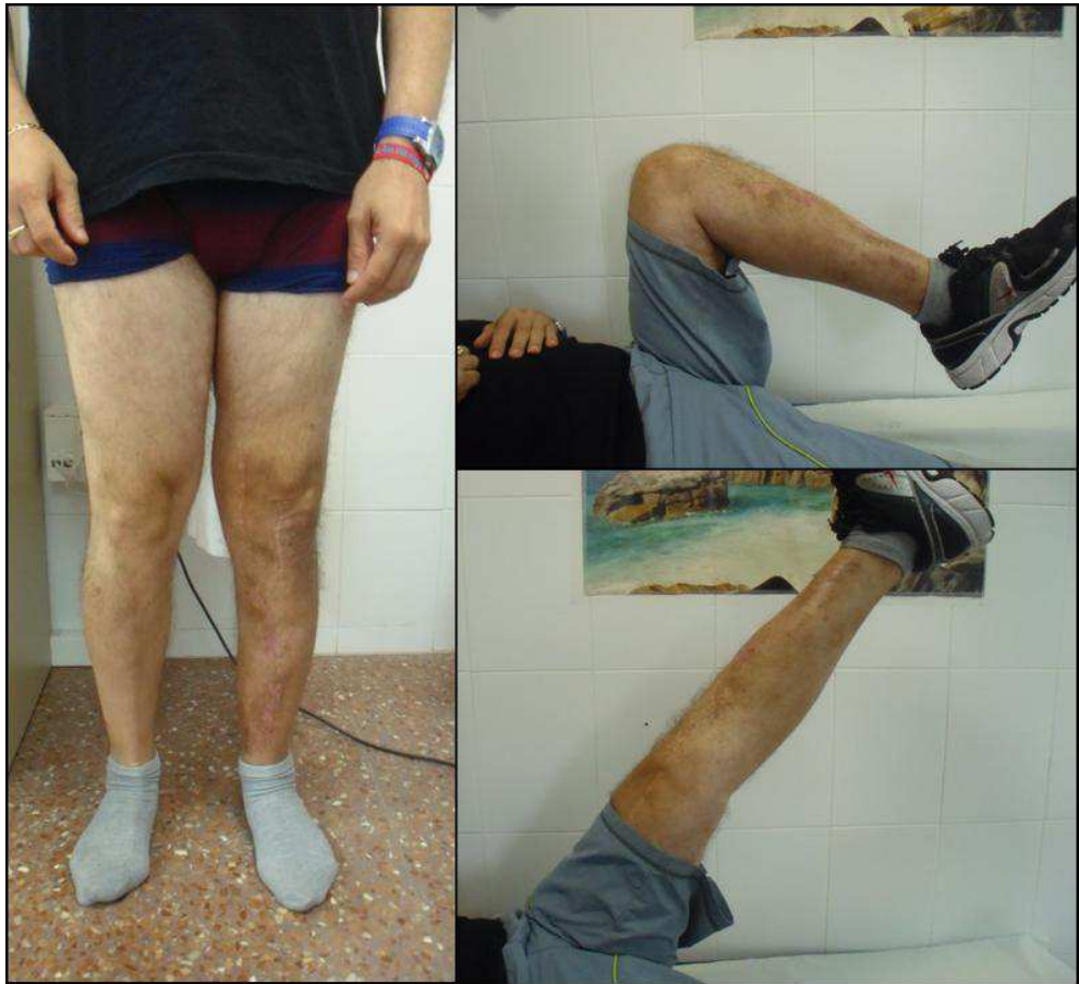
Fig. 6. Clinical view and range of motion at the last follow-up.