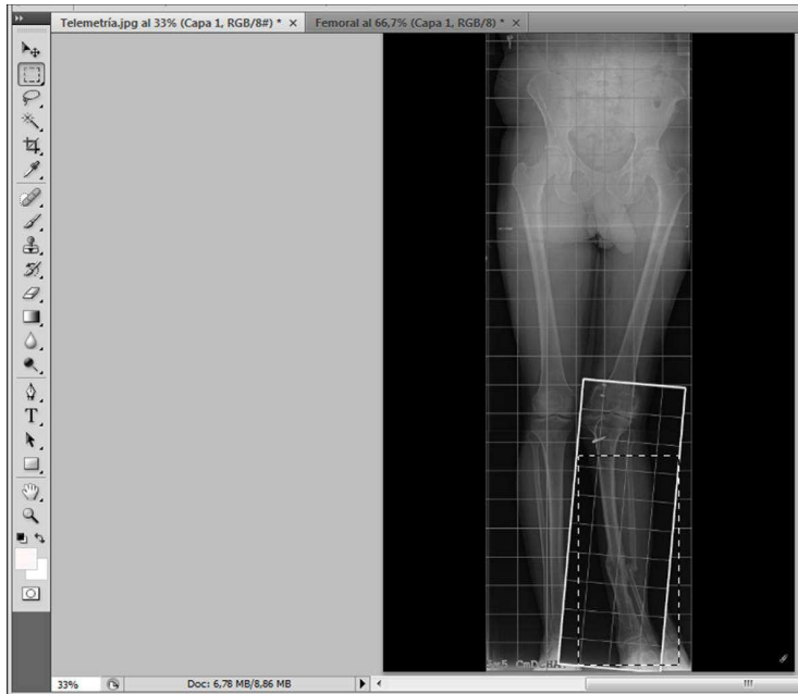
Fig. 3. Osteotomy level selection and osteotomy fragment reorientation with Adobe1 Photoshop1 CS4.

In this case, we plan two strategies. First option (no shown), one osteotomy for each problem, making of a lateral opening wedge femoral osteotomy of 5^\circ and two tibial osteotomies one in each CORA, a proximal medial closing wedge tibial osteotomy of 9^\circ and other distal lateral opening wedge tibial osteotomy of 6^\circ . But we have to be aware that we are going to do last osteotomy on an old fracture focus. Second option (Fig 4) is making a lateral opening wedge femoral osteotomy of 5^\circ and one medial closing wedge tibial osteotomy of 16^\circ upper of the proximal CORA. This option has some advantages; there are places that don't have any previous surgeries, with no skin incisions and allowing fixation with two plates. However we have to accept a slight translational deformity. We opted for the second strategy.