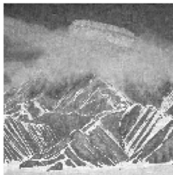
The cleaned version of the initial image