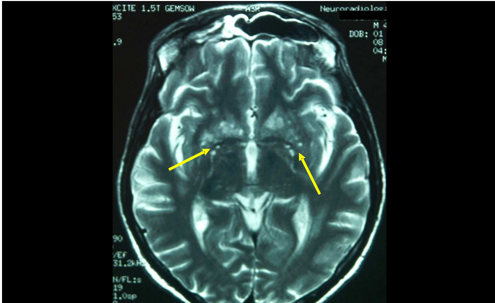
Fig. 1. Brain magnetic resonance of an AIDS patient with Cryptococcal meningitis, highlighting dilatation of the perivascular (Virchow-Robin) spaces