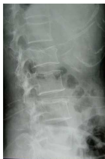
Fig. 2. Lateral X-ray before operation.