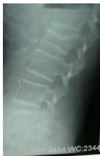
Fig. 1. Lateral X-ray at admission.

In this group of patients, the volume of bone cement injected in each vertebral was 3 ~ 6.5ml. When intraosseous vertebral venography were performed before the injection of bone cement, paravertebral vascular developed an image in 5 cases, then filled the gelatin sponge; peripheral cement leakage was found in 4 cases, intervertebral disc leakage was found in 2 cases and posterior margin leakage was seen in 2 cases (posterior longitudinal ligament is not exceeded), no clinical symptoms appeared. No nerve root or spinal cord injury, no pulmonary embolism or other complications were recorded. All patients had no further vertebral fractures. At admission, preoperative and postoperative X-ray films were shown in Figure 1-7. Figure 2 showed that bolster for self-replacement restored vertebral body height, corrected the kyphosis angle. Figure 5-7 showed that the PVP surgery could maintain and enhance the effect. The stata was showed in Table 1. Bolster for self-replacement combined with percutaneous vertebroplasty significantly improved VAS scores, analgesic use score and activity score, The results were shown in Table 2.