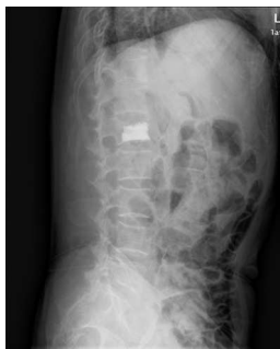
Fig. 9. Lateral X-ray after PKP.