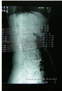
Fig. 3. Locating CT film before operation.