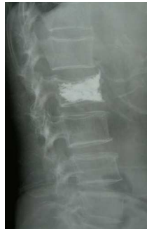
Fig. 5. Lateral X-ray after operation.