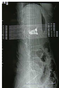
Fig. 6. Locating CT film after operation.