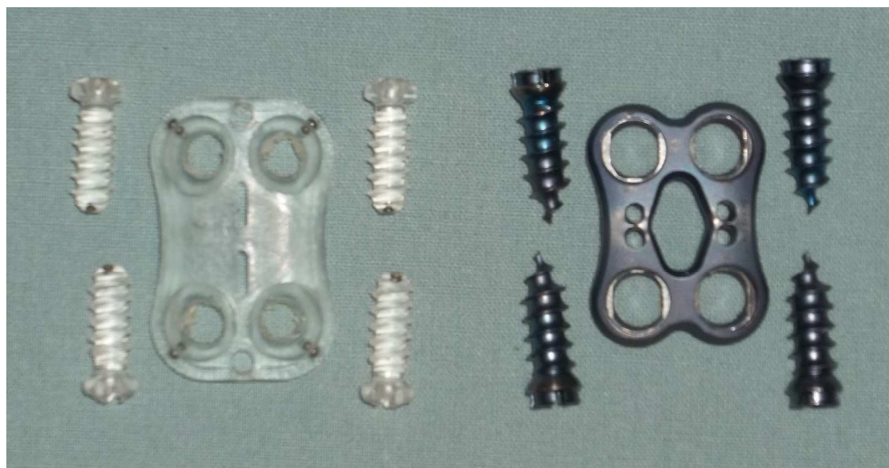
Fig. 4. Resorbable Plate and Screw System (Left) beside Nonresorbable titanium system (Right)

Resorbable plate and screw systems (RPSSs) have been used as far back as the 1970's, shortly after the introduction of their clinical potential, to fix mandibular fractures (Kulkarni et al. 1966; Kulkarni et al. 1971). More recently, RPSSs have been used to successfully treat distal radial fractures with no statistical difference compared to a titanium control (van Manen et al. 2008). RPSSs have also been shown to successfully treat rib fractures in trauma patients (Mayberry et al. 2003). Once adapted for use in spinal applications, RPSS's have been investigated for supplemental anterior fixation to cervical interbody fusion constructs. Although prospective randomized studies to date are limited, many retrospective analyses have concluded resorbable anterior cervical plating as a reasonable alternative to metal (Vacarro et al. 2002; Franco et al. 2007; Tomasino et al. 2009). RPSSs have also been considered for supplemental lumbar fixation (DiAngelo et al. 2002), however in-vivo loading conditions of the lumbar spine may prove too intense for this application.