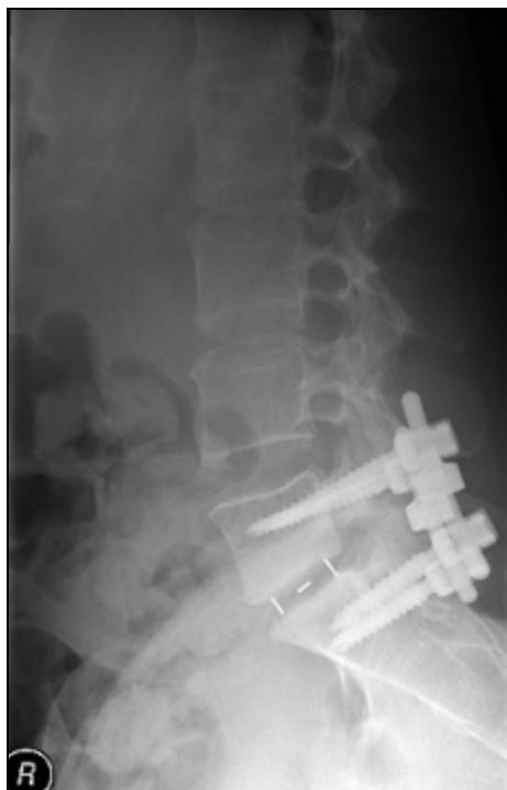
Fig. 3. Planar X-ray of Patient Immediately after Surgery with PEEK Cage and Titanium Rod Construct Implanted in the Lumbar Spine

Although PEEK implants offer improvements over titanium and titanium alloys, they are still subject to such complications as migration, subsidence, extrusion, wear debris and late foreign body reaction due to the fact that they are permanently implanted (Alexander et al. 2002; Smith et al. 2010). Furthermore, additional surgeries may be required to remove the constructs. These limitations have led clinicians to investigate bioresorbable polymers for use in surgical applications. Alpha-polyesters, mainly polylactic acid (PLA) and polyglycolic acid (PGA), are the primary bioresorbable materials used in clinical applications, and over the past decade such compounds have been used extensively in craniomaxillofacial, orthopedic and trauma applications for bone reconstruction and fixation.