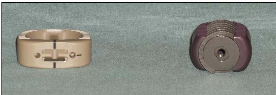
Fig. 2. PEEK Lumbar Interbody Cage (Left) alongside Titanium Lumbar Interbody Cage (Right)

Thermoplastic polyetheretherketone (PEEK) polymers, a subset of the polyaryletherketone or PAEK class of polyaromatic polymers, were initially considered for use in spinal applications to overcome the aforementioned limitations due to their inherent material properties, such as biocompatibility, radiolucency, and the ability to tailor their elastic moduli with fiber reinforcement such as carbon filament. Neat or unfilled PEEK has an elastic modulus of approximately 3.6 GPa, however this can be tailored to closely match cortical bone (18 GPa) or even titanium alloy (110 GPa) (Kurtz & Devine 2007). These properties, along with validation of their strength, wear, creep and fatigue resistance have pushed PEEK implants to be the most viable and attractive alternatives to metallic spinal implants to date. (Brown et al. 1990; Brantigan & Steffee 1993; Kurtz & Devine 2007). Figure 3 is an x-ray taken from a patient following implantation of a PEEK cage along with a pedicle screw and titanium rod system. Notice the radiolucency of the PEEK cage; only the radiopaque markers inside the implant are visible.