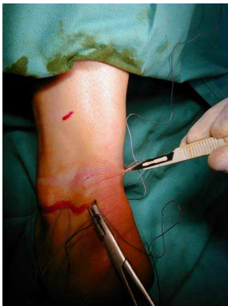
Fig. 5. (Widening the hole with blade No. 11)

After approximating the torn Achilles tendon ends, the lateral end of the thread is passed medially (see scheme g on Figure 4) (both ends of the thread must be held tightened at that time) where, after final tightening, the suture is tied (see scheme h on Figure 4). The knots are sunk (buried) subcutaneously through the previously widened second medial stab wound distally (see scheme i on Figure 4). At the end nothing can be seen on the surface, except eight small stab wounds and the folds of skin that later completely disappear (see Figure 6). Small stab wounds can be closed with very fine sutures but this is routinely not performed (Cretnik et al. 2004, 2005, 2010).