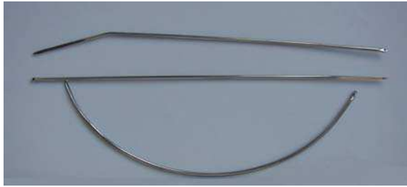
Fig. 2. (Needles)