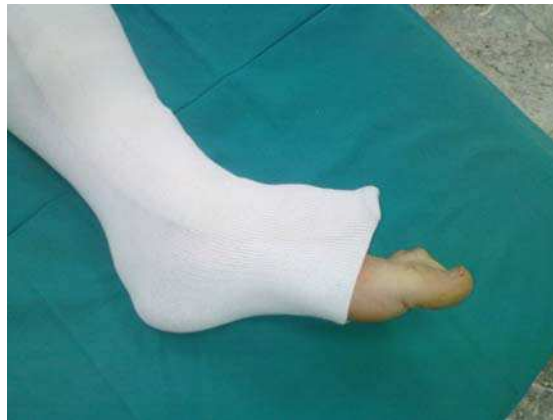
Fig. 8. (plantar flexion in orthosis)

After three weeks a new immobilization with the foot in neutral position (zero degrees of dorsiflexion) is applied. It's made in the same way to enable plantar flexion of the foot and to prevent dorsiflexion. It can also be made of cast, but softcast is much more convenient, lighter and water resistant. Patients keep walking with crutches and are allowed to bear weight as tolerated. They may walk with orthosis without crutches if they are able to and have no pain.