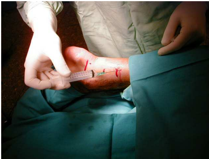
Fig. 3. (Infiltration with lidocaine)

Before starting, the rupture and diastasis (gap) must be localized (see Figure 1). After that, proximally (about five cm) and distally (about four cm) around the palpated gap, the cutis, subcutis and peritendineum are infiltrated at the marked points on the Figure 1. (see also Figure 3) All together there are eight puncture holes where the thread is later led. No other medications, nerve blocks or other types of anesthetics are given.