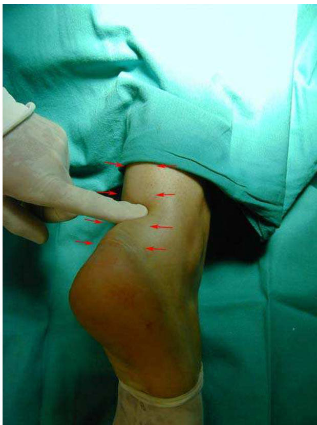
Fig. 1. (Palpating the gap)

Resorbable thread - Vicryl (polyglactin) No.2, length at least 50 cm (Ethicon, Sommerville, New Jersey) on long (up to 15 cm) semicurved (could be also straight or specially bent), at the end triangularly cut needles (HeliPro, Jesenice, Slovenia) is used (see Figure 2). Usually any other long needle can be used - the procedure can be performed more conveniently with two needles (at each end of the thread), otherwise the needle must be swapped from one end of the thread to another.