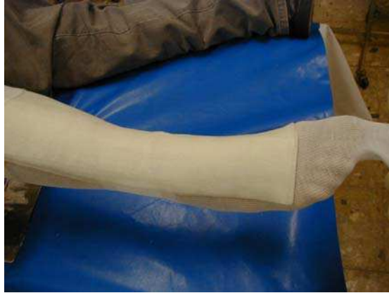
Fig. 7. (Softcast functional orthosis – preparation with stockinette)