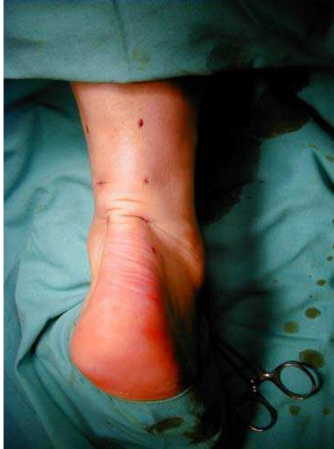
Fig. 6. (Final outlook)

Approximation can be intra- and postoperatively controlled by ultrasonography - transducer is simply put into the sterile glove (or standard protection cover for arthroscopy) with the use of sterile gel or lidocaine gel (regularly used in urology). If any gap between the torn ends persists they should be pulled together with both ends of the thread further before the suture is tied (foot should be positioned in the maximal plantar flexion). Before final tightening it's very useful to gently manipulate with the foot in plantar and dorsal direction, so the thread can really be sunk at the surface of the tendon and the approximated ends secured with the tensioned thread without any loops or soft tissue captured. In the majority of cases disappearing of the gap and good approximation can be easily palpated but in the first cases until some experience is gained or if any doubt about that persist it's very helpful to use the ultrasonographic control.