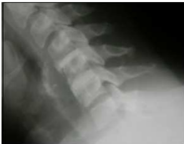
Fig. 3. Anterior cervical decompression and fusion (ACDF) with Acrylic cage at C4-C5 level FLx. vertebral.