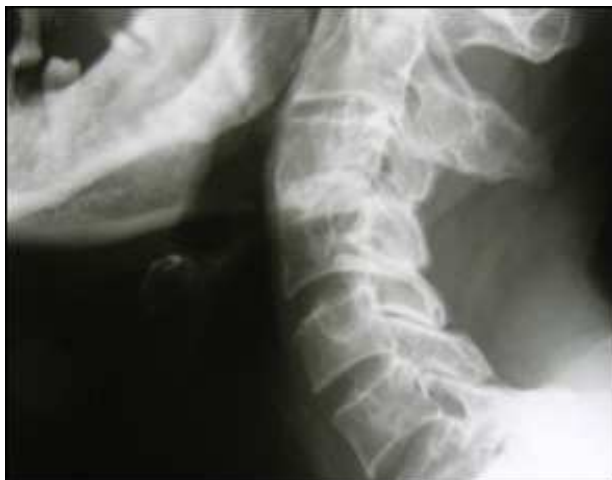
Fig. 2. Anterior cervical decompression and fusion (ACDF) with Acrylic cage at C3-C4 level extension view.