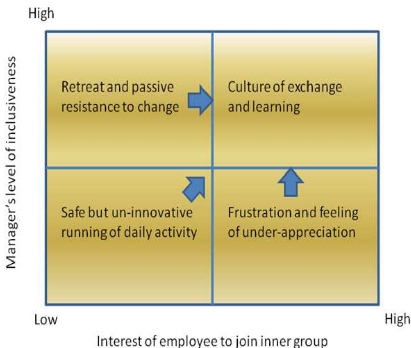
Fig. 2. The manager as a leader: fostering a culture of exchange and learning.

process. Designing and driving the knowledge management process in daily operations becomes part of a larger, strategic transformational program that can be amended and improved. Compare and contrast this concept to the Ford model mostly based on scientific management theory, on efficiency, and on applying process rules with little departure from the status quo (Taylor, 1911 ; Ford and Crowther, 1922). Scientific management surely has its advantages in terms of cost avoidance, risk minimization, reaching business targets quantitatively, and predictability of the final product. But it may be misused within the organization to a point where it stifles creativity. Further, processes and company policies could be used sometimes by those who do not encourage change, or who have reached a comfort zone, or those who have managerial power and do not wish to relinquish it. This leads us to the second framework related to transformational leadership in the organization. The basic hypothesis that we test is that companies that approach knowledge management from a transformational leadership perspective are better positioned to innovate and launch new products successfully than the ones that do not.