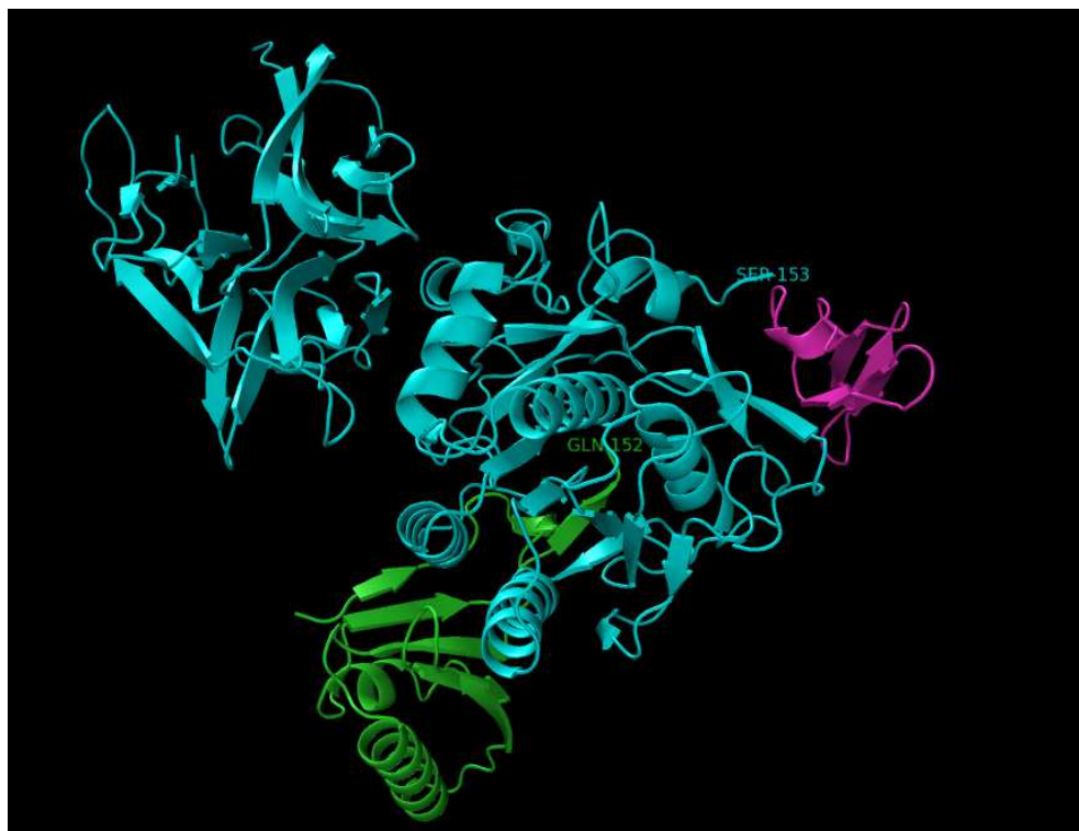
Fig. 2. Co-crystal structure of PCSK9 and EGFA domain of LDLR. Green, prodomain. Blue catalytic and CHRD. Purple, EGFA. Gln152 and Ser153 were labeled (Courtesy of Dr. Yong Wang and Dr. Yue-Wei Qian).

Importantly, statin treatment of PCSK9 deficient mice further augmented the liver LDLR protein levels, demonstrating the additive effects of PCSK9 deficiency and statin treatment on LDLR protein expression (Rashid et al., 2005).