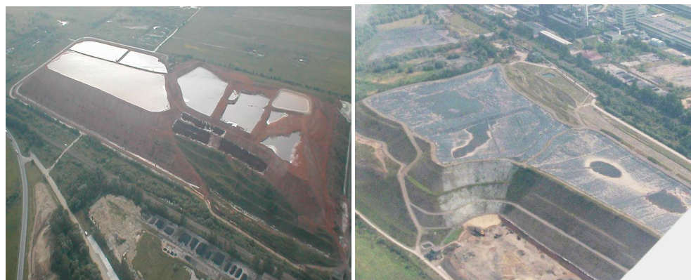
Fig. 2. Bauxite residue (brown and red mud) dump in aluminium work in Slovakia before (left, 2006) and after (right, 2011) revitalization.

predominantly in the form of quartz, sodalite, gypsum, calcite, gibbsite, rutile, represent other minority components. In Tab. 1. chemical composition of waste mud from several world aluminium oxide producers is shown. All the data, except for Slovakia, is related to waste mud originated by the Bayer process (red mud).