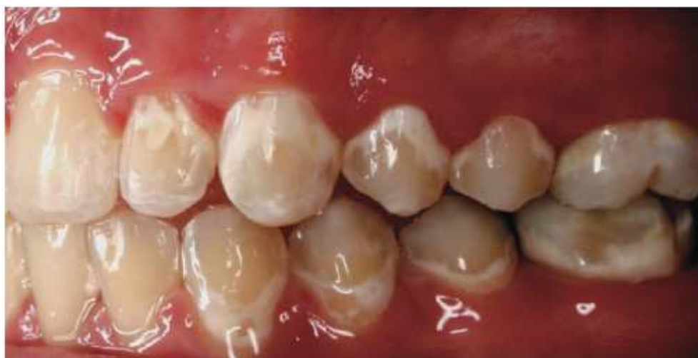
Fig. 1. Incipient caries lesions (white spots) develop around brackets and bands due to poor oral hygiene

One of the most common negative side effects of orthodontic treatment with fixed appliances is the development of incipient caries lesions around brackets and bands, particularly in cases with poor oral hygiene (Fig. 1). Caries lesions typically form around the bracket interface, usually near the gingival margin (Gorelick et al. , 1982). Certain bacterial groups such as mutans streptococci and lactobacilli ferment sugars to create an acidic environment that over time might lead to the development of dental caries. Since orthodontic appliances make plaque removal more difficult, patients are more susceptible to carious lesions. The irregular surfaces of brackets, bands, wires, and other attachments also limit naturally occurring self-cleaning mechanisms, such as movement of the oral musculature and saliva (Rosenbloom and Tinanoff, 1991).