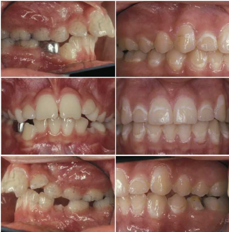
Fig. 2. Tooth labial surfaces were examined and scored from left first molar to right first molar, maxilla and mandible, before and after orthodontic treatment.

Images were evaluated by trained investigators using a scoring system specifically adapted for use with photographed images ( International Caries Detection and Assessment System II ; Ismail, 2005). Visible labial surfaces examined included maxillary and mandibular central and lateral incisors, canines, first and second premolars, and first molars. The evaluators scored each visible labial tooth surface before and after orthodontic treatment. The scores were combined to determine the labial caries incidence for each patient. Teeth were examined and scored from first molar to first molar, maxilla and mandible (Fig. 2).