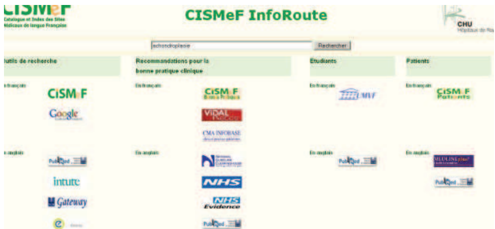
Fig. 3. CISMeF InfoRoute.