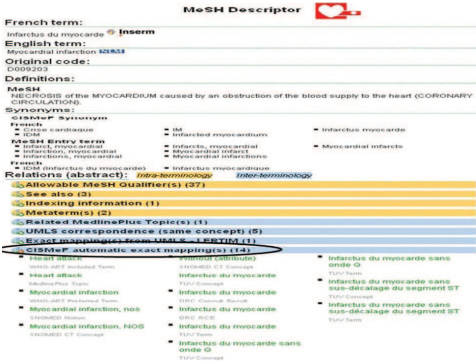
Fig. 2. Mapping of the MeSH term “myocardial infarction” according to the lexical approach in HMTF (Exact correspondence).