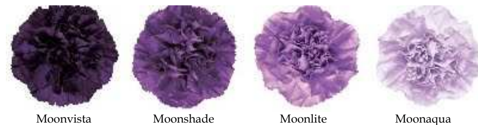
Fig. 1. Florigene blue carnations

Roses, carnations, lilies and orchids all lack a class of blue pigments called delphinidins, named after the violet-blue we see in delphinium. The gene for delphinidin production is what the Florigene scientists removed from petunia and transferred to the carnation. ( http://www.arhomeandgarden.org/plantoftheweek/articles/blue_carnation.htm )