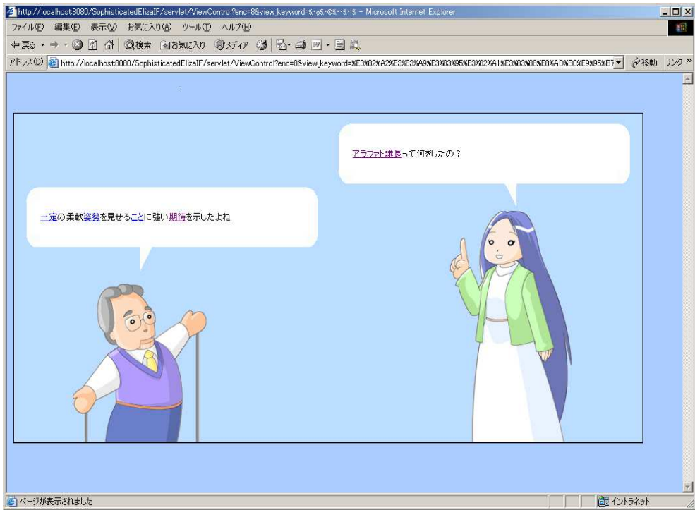
Fig. 1. Screenshot of Sophisticated Eliza