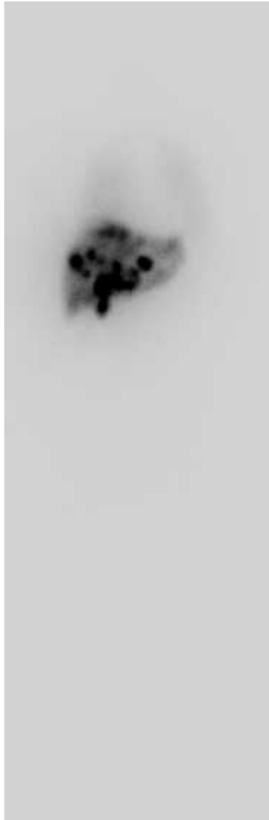
Fig. 1. Quantitative whole body scintigraphy obtained 7 days post therapeutic in a 52-year-old man showing significant activity in the HCCs and only a faint lung uptake.

small amounts of “cold” Lipiodol (Guerbet®). In patients with “normal” hepatic arterial anatomy the catheter can be positioned in the main hepatic artery for nonselective injection of 131 I-Lipiodol. In cases with multiple nodules or variable arterial blood supply, the liver lobe containing the largest tumour mass is treated in the first session and the remaining masses in the following ones.